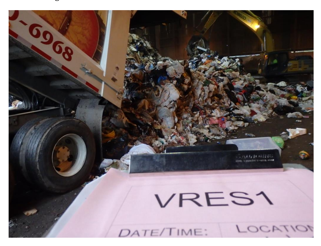
Residential Hall Tipping