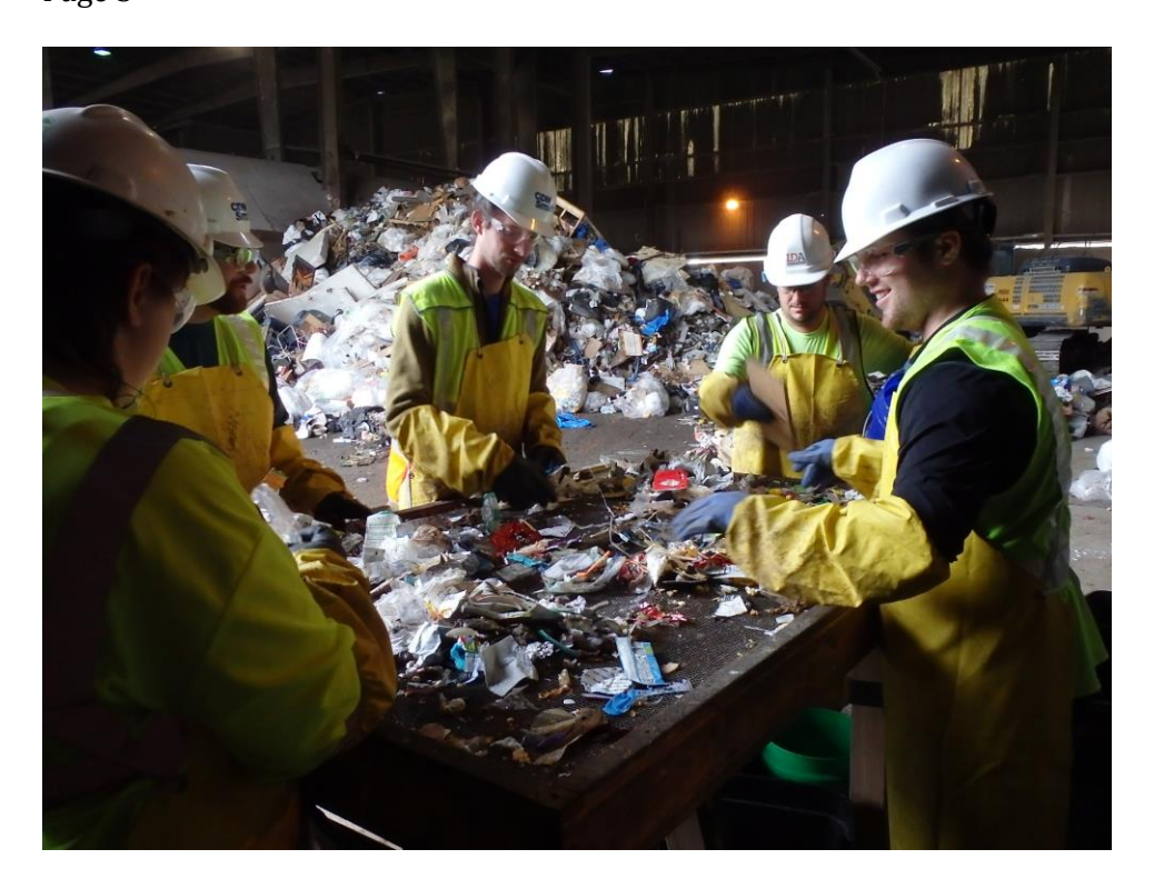
Hand Sorting Table

Fall Sort – Week 1 Summary October 16, 2017 Page 5