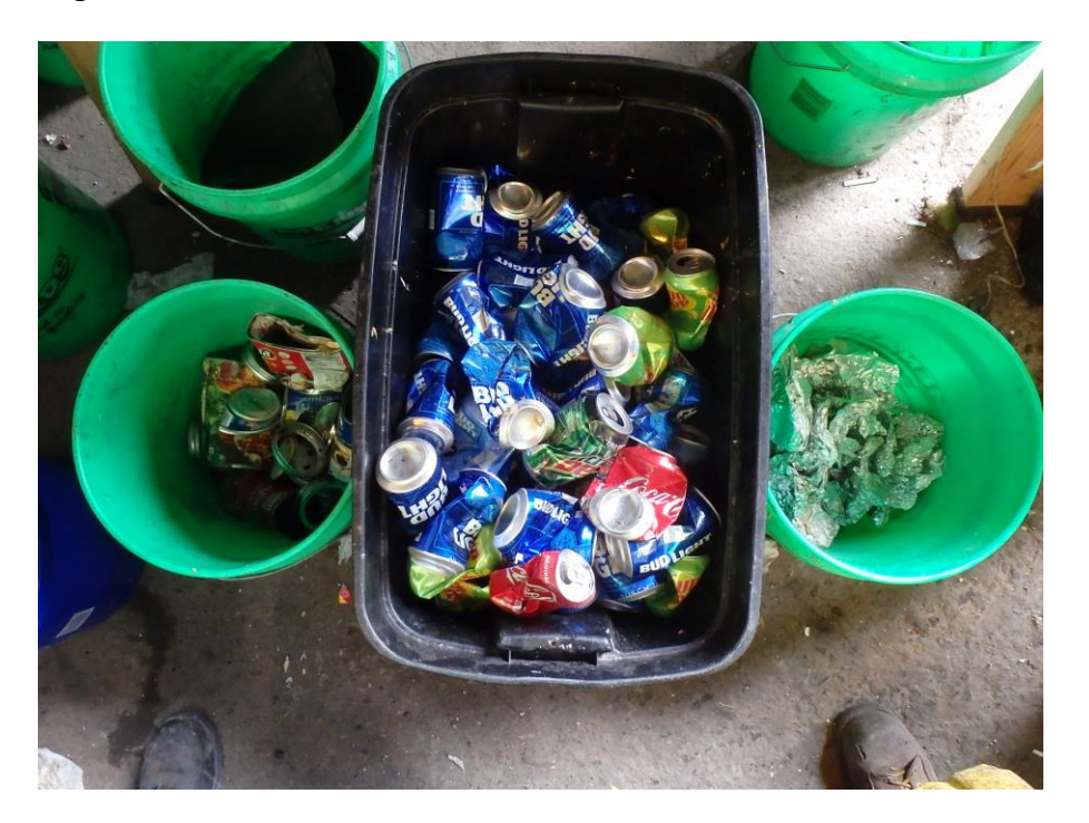
Plastic, metal, and aluminum containers