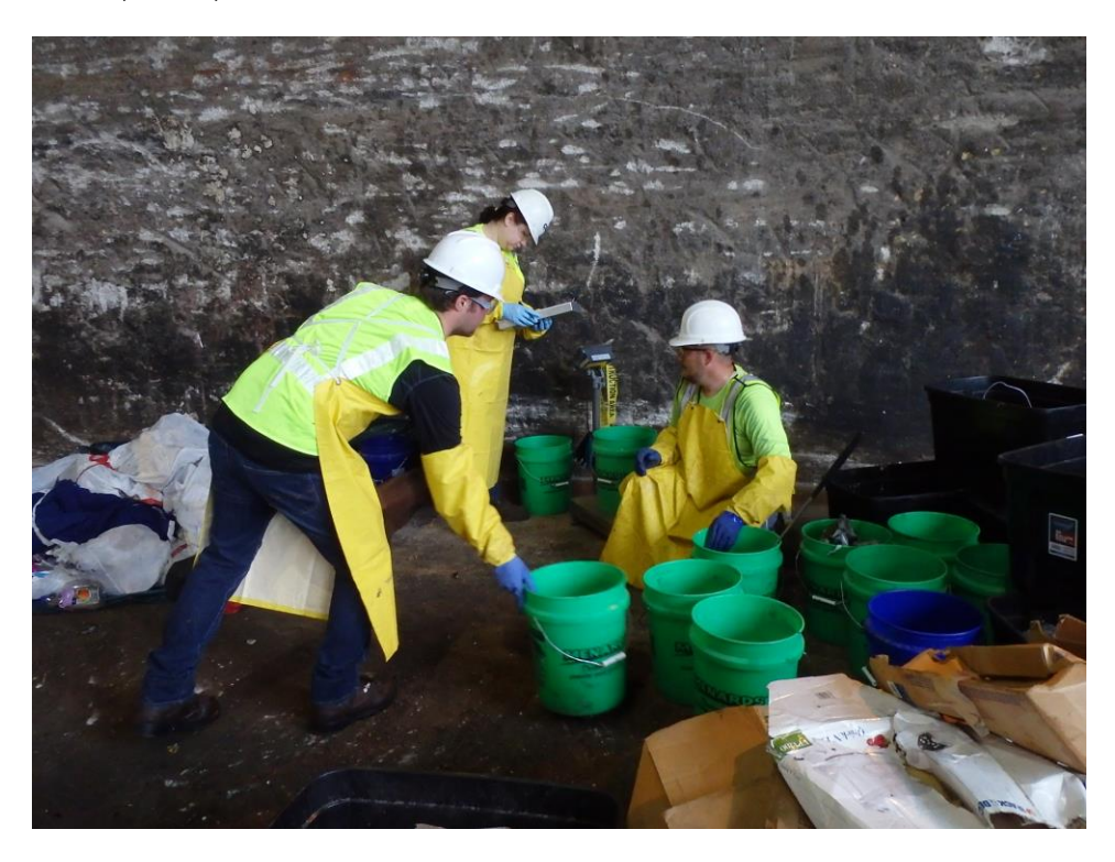
Weighting Material Bins Post Sort