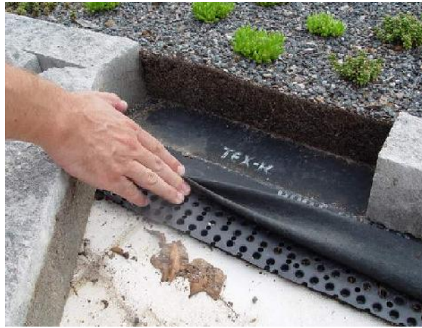
Figure 11.2. Photos of Vegetated Roof Cross-Sections