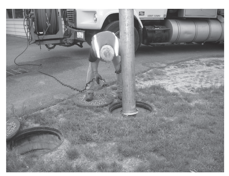
A Cascade Separator unit can be easily cleaned in less than 30 minutes.