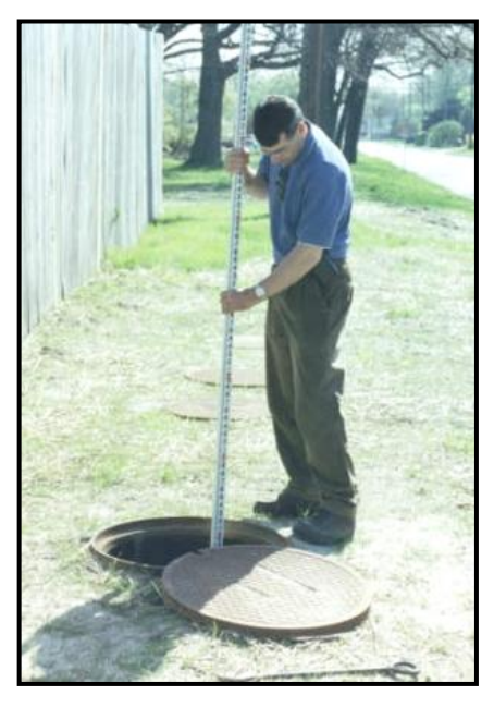
Sediment inspection using a stadia rod