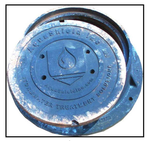
Aqua-Swirl<sup>®</sup> manhole cover

In order to ensure that our systems are being maintained properly, AquaShield<sup>TM</sup> offers a maintenance solution to all of our customers. We will arrange to have maintenance performed.