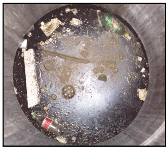
Floatable debris in the Aqua-Swirl®