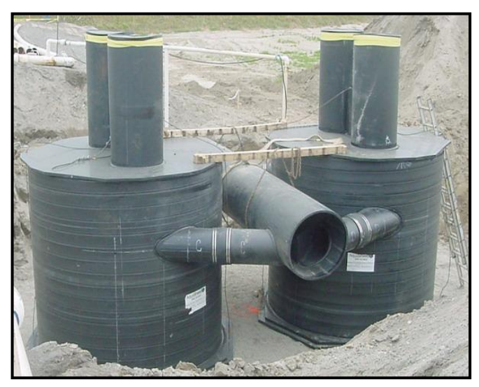
Custom designed AS-9 Twin Aqua-Swirl®

The Aqua-Swirl<sup>®</sup> system can be modified to fit a variety of purposes in the field, and the angles for inlet and outlet lines can be modified to fit most applications. The photo below demonstrates the flexibility of Aqua-Swirl<sup>®</sup> installations using a "twin" configuration in order to double the water quality treatment capacity. Two Aqua-Swirl<sup>®</sup> units were placed side by side in order to treat a high volume of water while occupying a small amount of space.