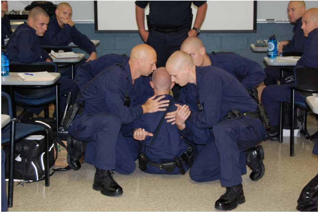
Session 69 demonstrates the two and four man carry during emergency medical training.