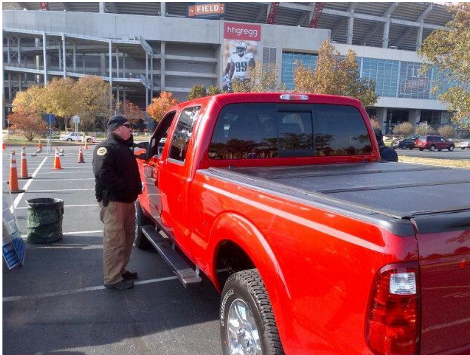
Auto Theft detectives offering VIN etching (theft deterrent) at the Shred Day event.