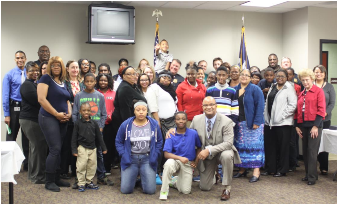
Strengthening Families Program graduation

Youth Services celebrated the 19 th graduation of the Strengthening Families Program on November 10 th .