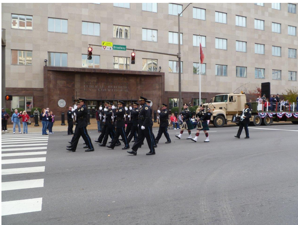
Drill & Ceremony Team