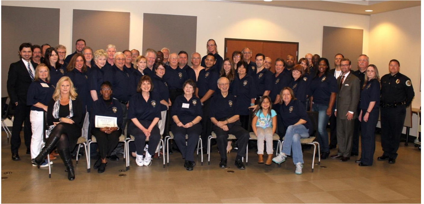
Citizen Police Academy graduates