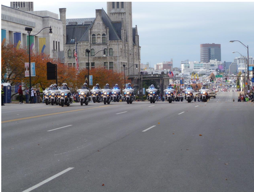
MNPD motorcycles leading Veterans Day Parade