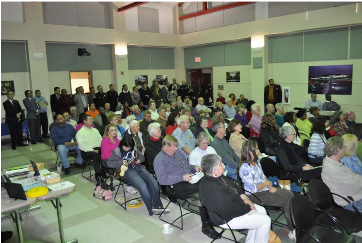
Citizens participated in a community meeting at the South Precinct to discuss a variety of public safety issues.