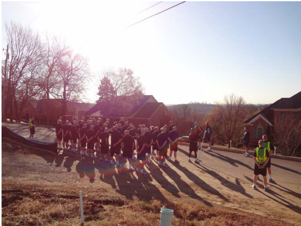
Trainees prepare for a morning run.