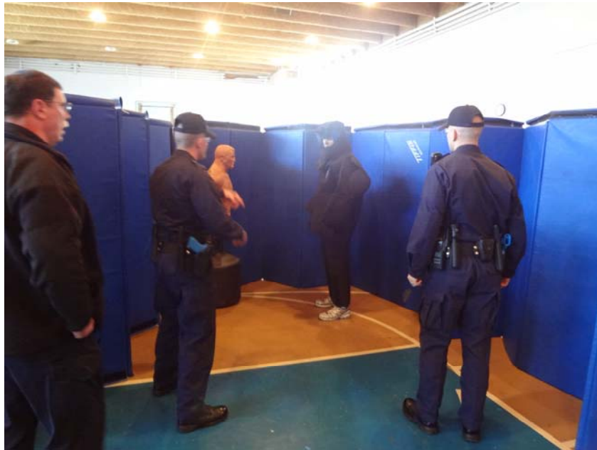
Trainees participate in taser practicals.