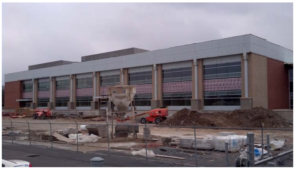
Construction is continuing on the building that will permanently house the Madison Precinct and the DNA Crime Laboratory. Move in is expected in January.