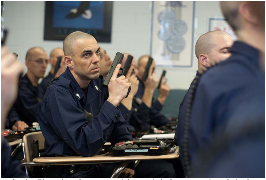
Session 70 receives classroom training on their department issued pistols.