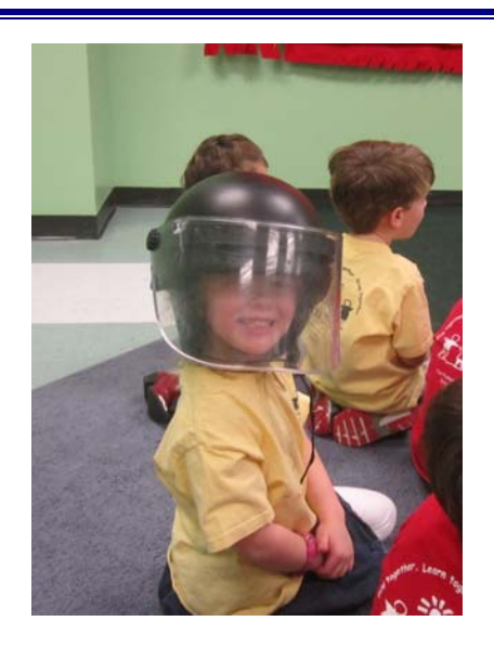
Youth Services Division