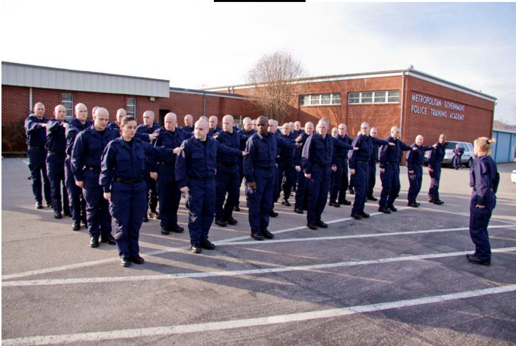
Drill & Ceremony Training