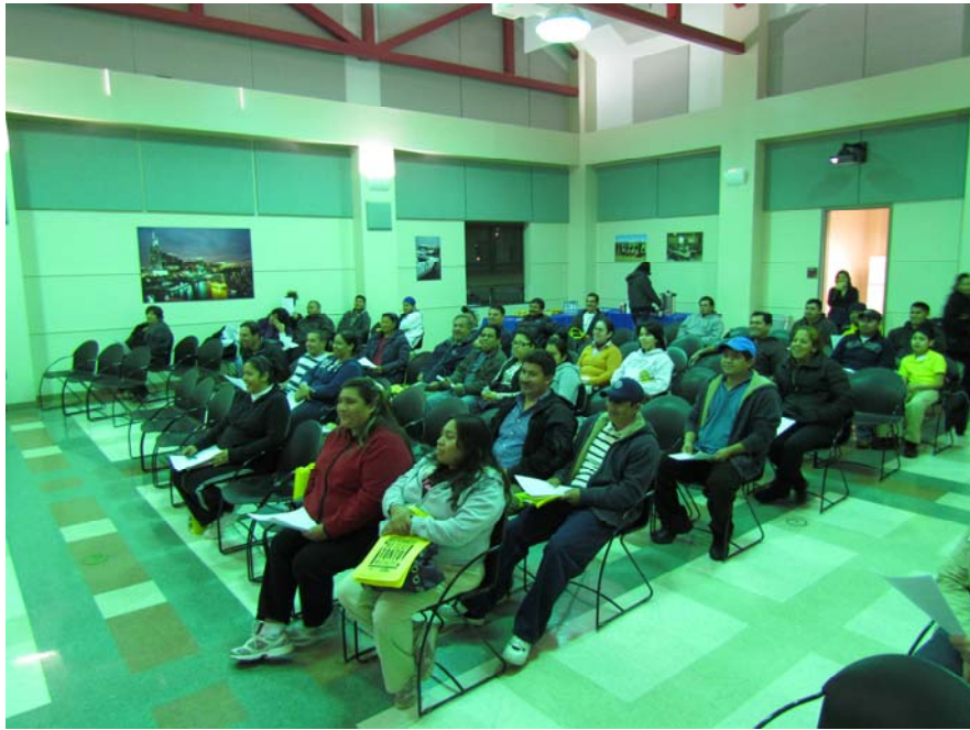
El Protector safety meeting.

More than 50 persons attended the gathering aimed at continuing to build trust between the Hispanic community and the Police Department. The El Protector Program intends to conduct these meetings on a monthly basis in order to discuss a wide variety of issues.