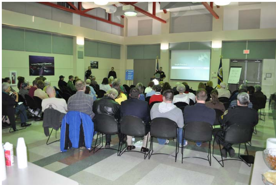
South Nashville residents attend informational meeting.

Nashville residents gathered Thursday for an informative presentation from the Gang Unit in the South Precinct community room.