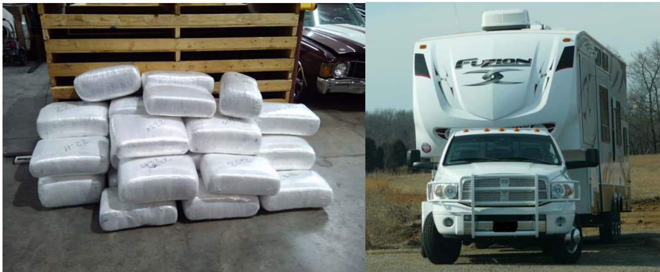
Seized marijuana, truck and travel trailer.

This investigation remains active and has also been supported by detectives from the Specialized Investigations Division, Crime Suppression Units from the Hermitage, South and Madison Precincts and the TBI. Seized thus far, in addition to the marijuana, are five vehicles, the travel trailer and more than $20,000 cash.