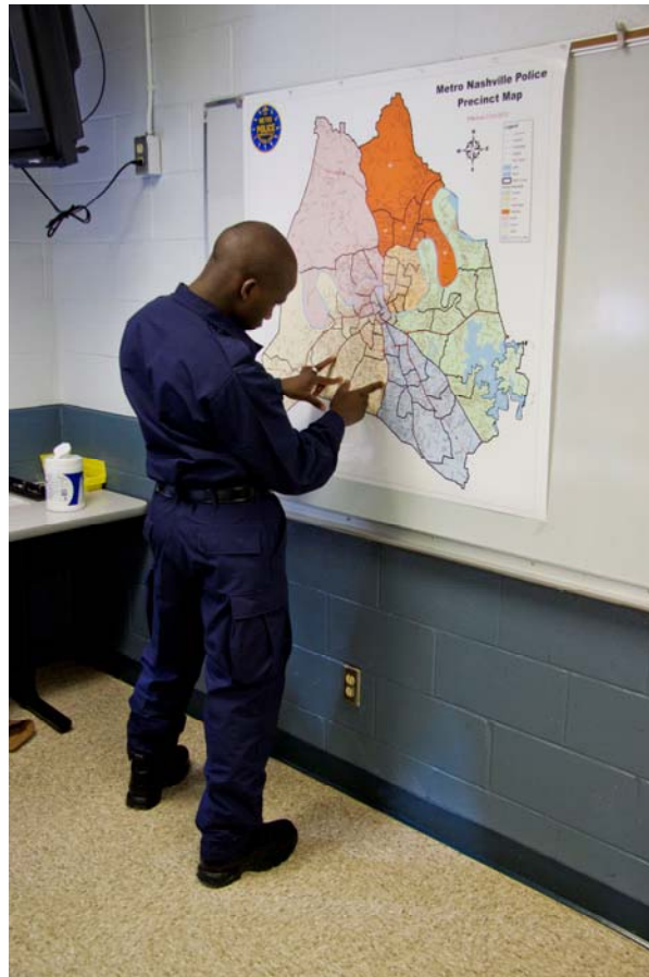
Trainee studies Precinct boundaries.