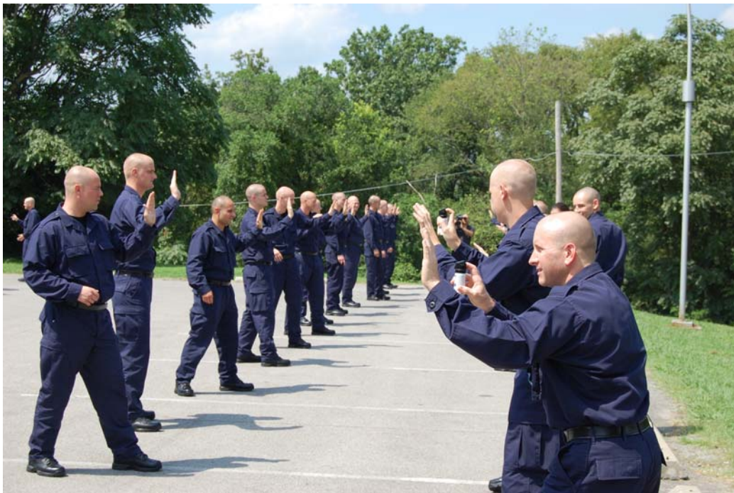
Pepper spray training.