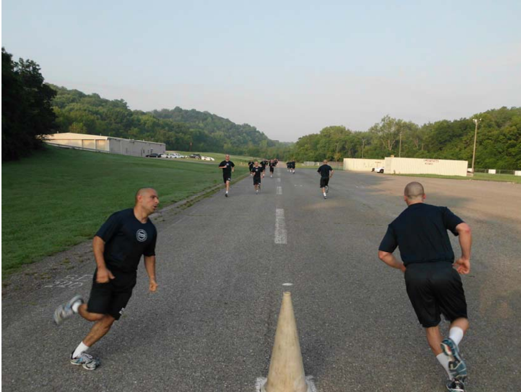
Physical training test.