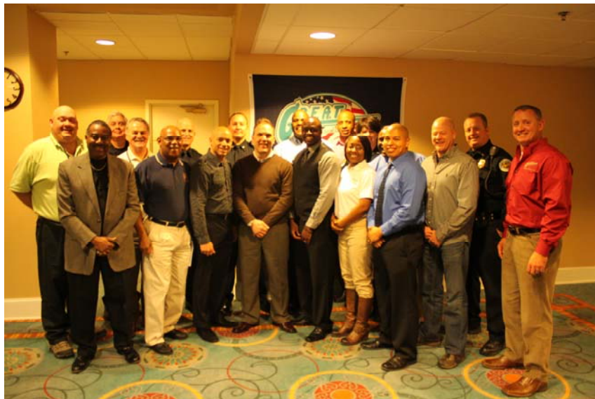
G.R.E.A.T. training graduates and instructors.