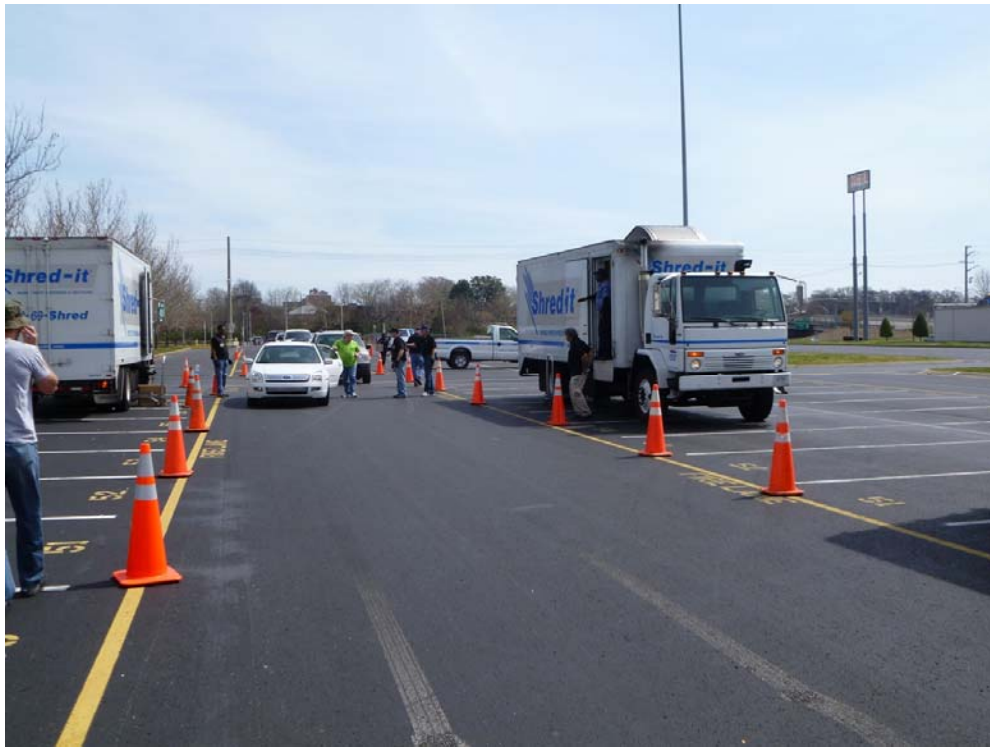
A steady flow of citizens came to Saturday's Shred Day event at LP Field.