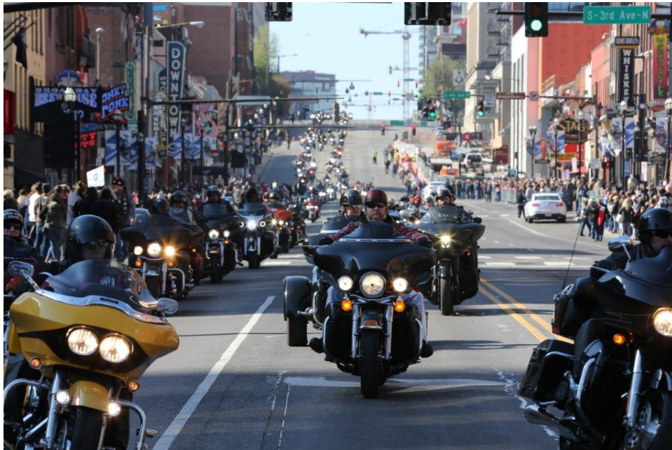
Riders travel down Broadway in downtown Nashville.