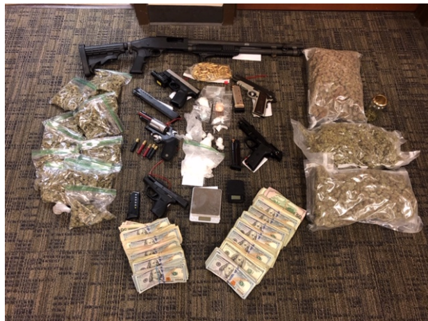
Seized guns, drugs, and cash.

In addition to ATF agents, SWAT officers assigned to the Special Response Team also assisted in the operation.