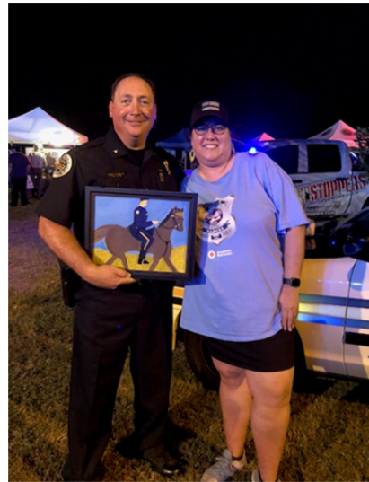
The West Nashville Night Out Against Crime event at Richland Park drew hundreds of community members.

Community engagement activities included fun projects, ice cream socials, and a surprise “cops and robbers” birthday party.