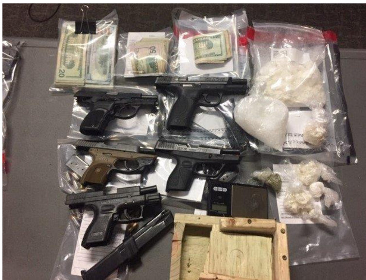
Seized guns, money, and drugs