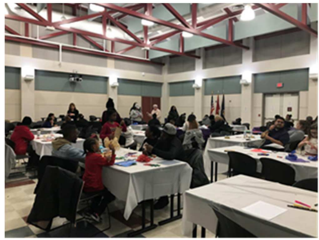
Family members who lost loved ones to homicide made ornaments at North Precinct for the Season to Remember ceremony.