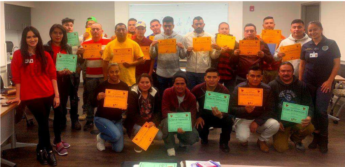
Family Intervention Program personnel working with a group of folks to prevent victimization.