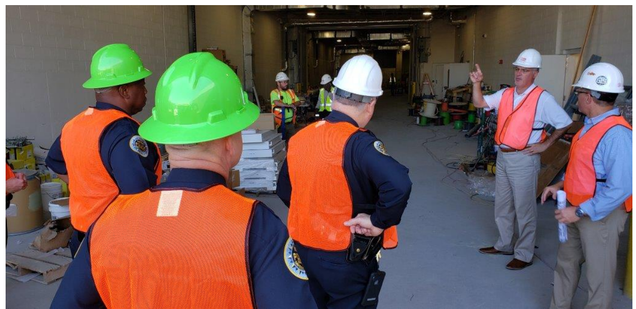
Officers will enter the new Downtown Detention Center through a garage at Gay Street and 2<sup>nd</sup> Avenue North.