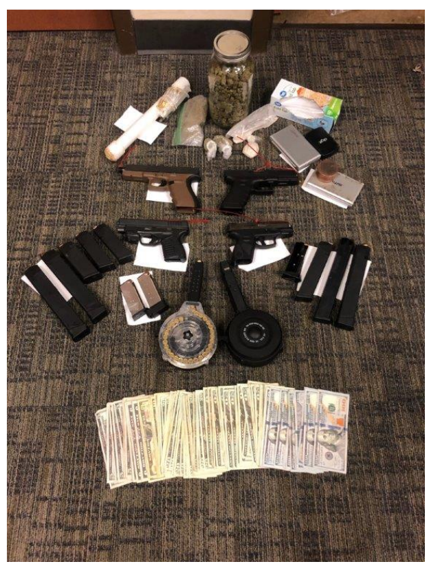
Tampa Drive seizures

West Precinct undercover detectives recovered 24 grams of heroin, a half-pound of marijuana, a small amount of cocaine, 4 pistols and $2,255 cash during the execution of a search warrant at the Tampa Drive residence.