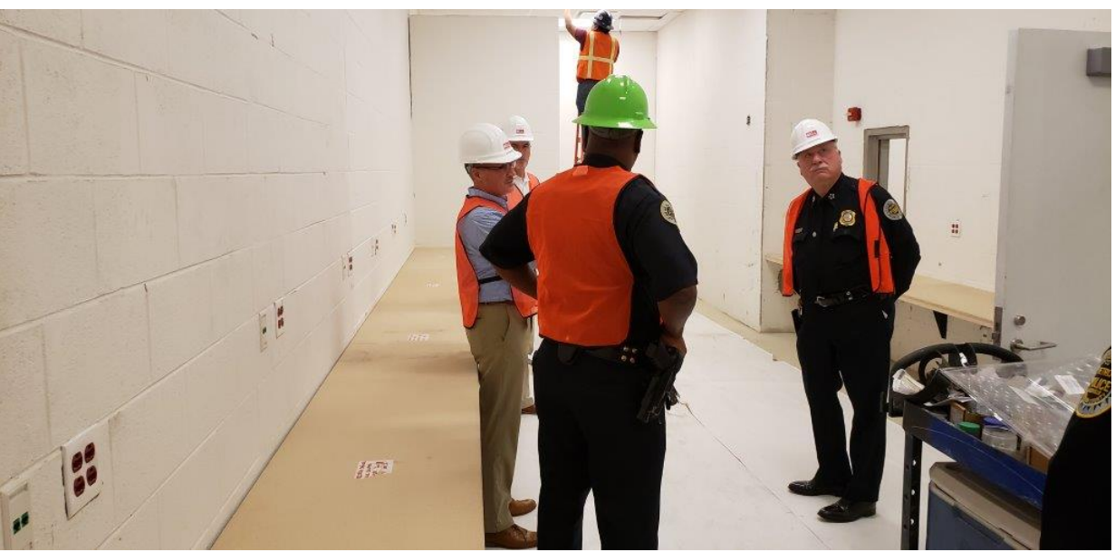
MNPD leadership tours the officer workroom at the new Downtown Detention Center.

Now an update from our IT Division concerning in-car/body worn cameras: The final contract with the vendor, WatchGuard, was signed last week. WatchGuard is working to provide a project plan and a proposed timeline for implementation. The infrastructure for storing WatchGuard video is projected to be finished in mid-October, with the installation of computer servers coming next. More information about camera deployment will be shared in the coming weeks as we work with WatchGuard on expectations for training, equipment deployment and installation. Our IT Division is working closely with the vendor.