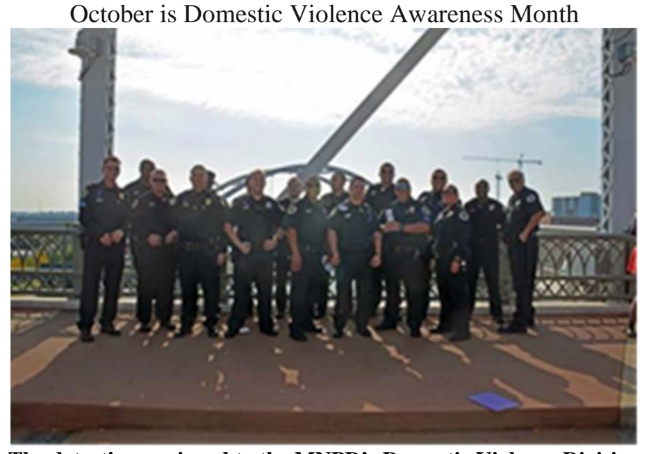
The detectives assigned to the MNPD's Domestic Violence Division