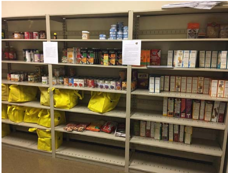
Food pantry at West Precinct.

The pantry primarily stocks nonperishable items including soup, peanut butter, crackers, and canned vegetables and meat. Items for babies/infants such as diapers, formula, and cereal are also supplied on a limited basis.