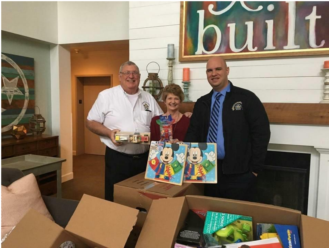
The FOP donated toys to the Ronald McDonald house in Nashville.