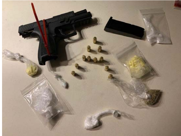
Seized gun and drugs.

possession. Hughes, who has prior cocaine and Schedule V1 drug possession convictions, is being held in lieu of $100,000 bond.