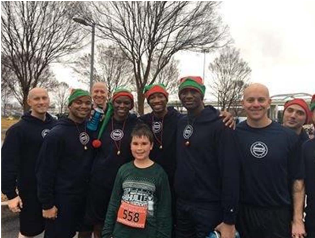
This young man's family wrote to thank the training class for cheering him on!