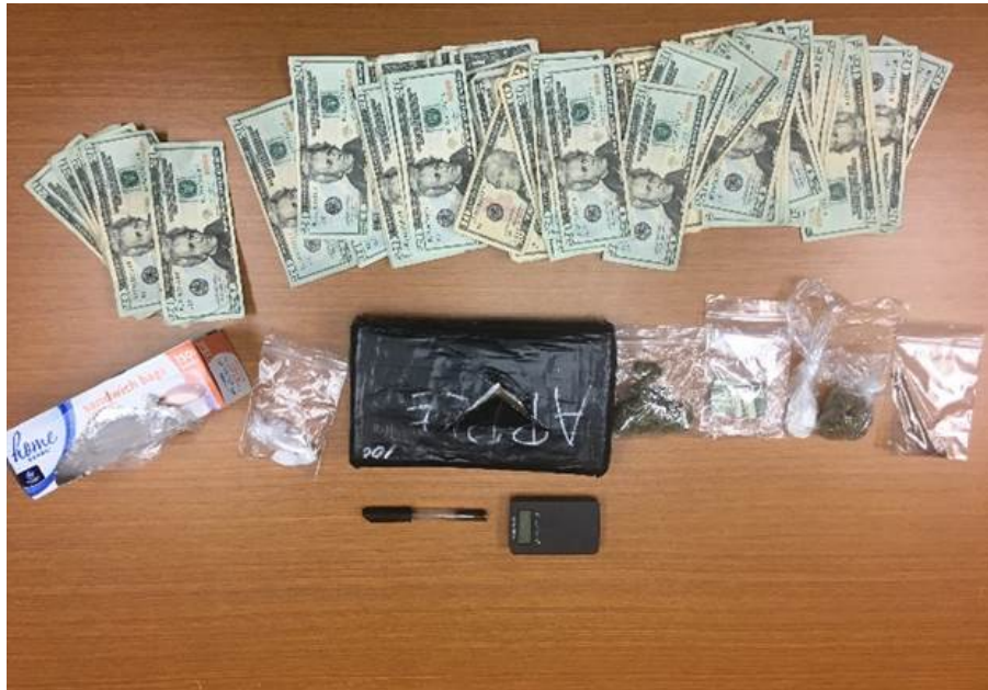
Seized cocaine, marijuana, and cash.