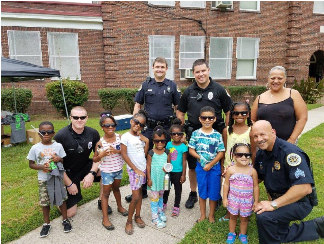
Kids are sporting their new sunglasses from North Precinct officers during Night Out activities at the McGruder Family Resource Center.