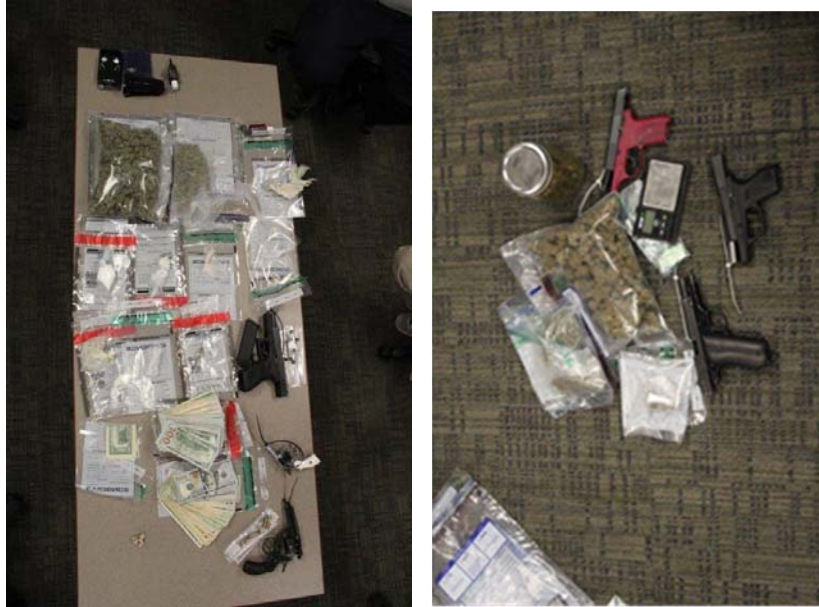
Seized drugs, guns, and cash.

Two unrelated drug cases on September 7 th from 1027 43 rd Avenue North and 1408 57 th Avenue North resulted in the seizure of cocaine, marijuana, pills, and pistols. Seven persons were arrested.