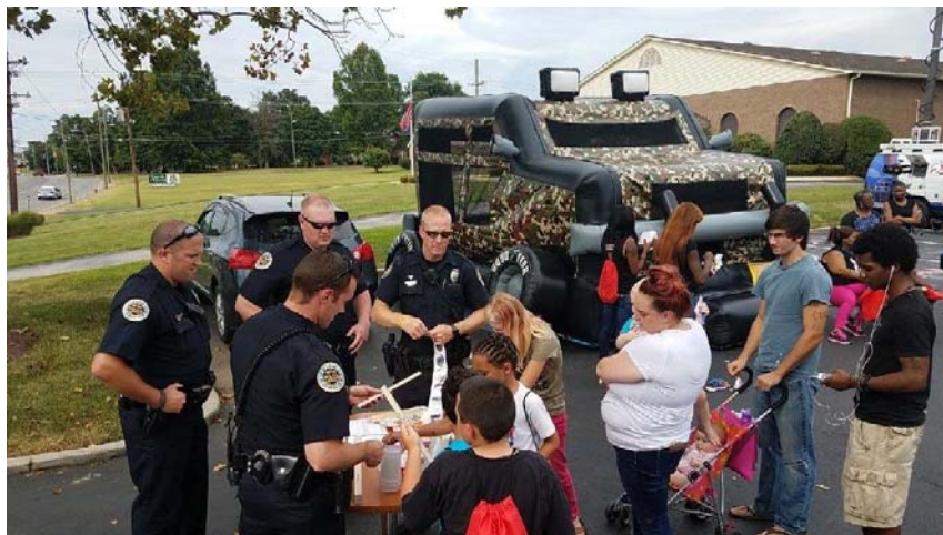
Night Out Against Crime event at Remington College, 441 Donelson Pike.

Central Precinct officers hosted Night Out Against Crime festivities, including a helicopter landing downtown.