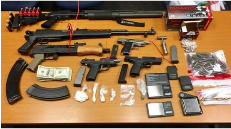
Seized cocaine, guns, and cash.