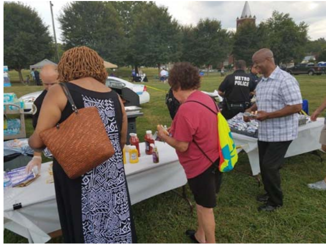
East Precinct hosted Night Out in East Park with officers staffing the hotdog grill.