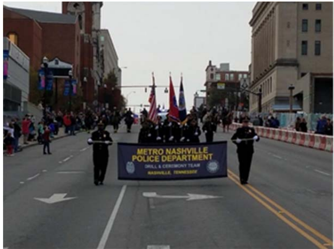
MNPD Drill & Ceremony Team