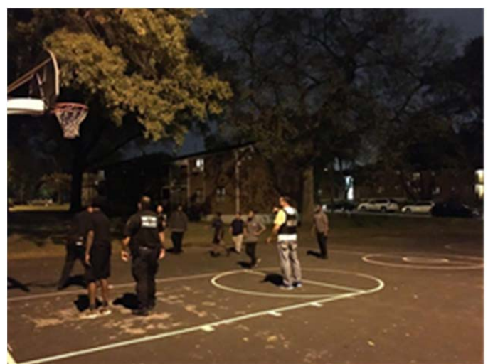
Officers on November 2 nd enjoyed a friendly game of basketball with Cayce Place youth.