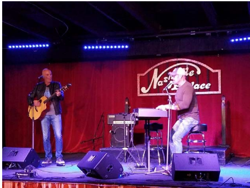
Special guest Phil Vassar is an annual performer at the Law Enforcement Talent Showcase.