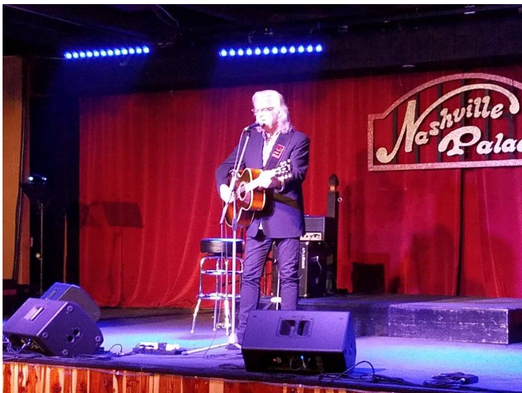
Grand Ole Opry star Ricky Skaggs on the Nashville Palace stage.