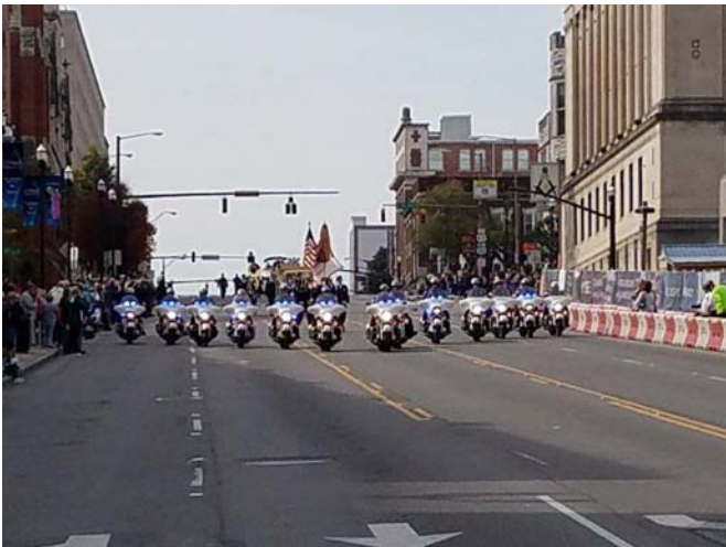
MNPD motorcycles leading the parade