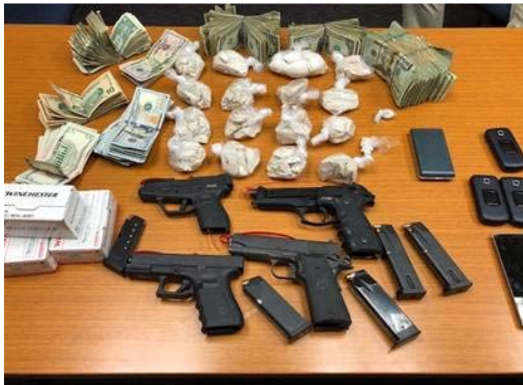
Seized guns, heroin, and cash.