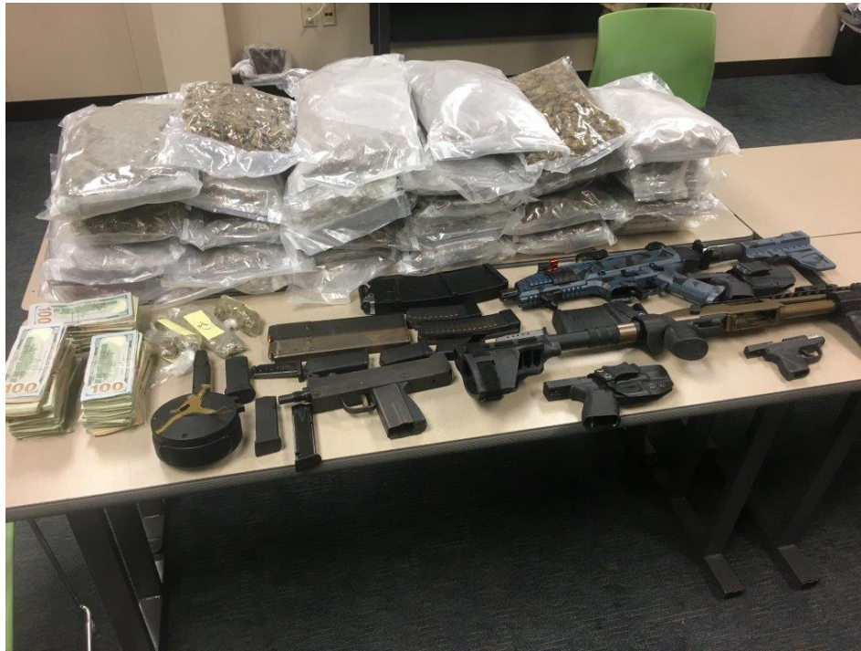
Seized guns, marijuana, and cash.