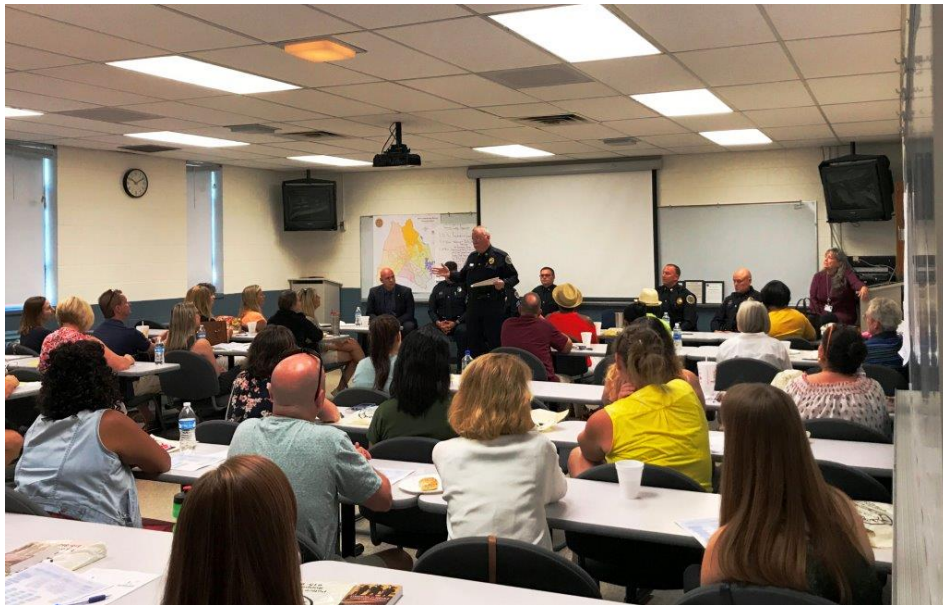
Family orientation day.

On Saturday, June 10 th the Behavioral Health Services Division hosted Family Day orientation prior to Session 81 graduation. Seventy-three attendees had the opportunity to tour the MNPD Training Academy and ask questions about what to expect as police families.