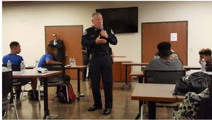
Chief Anderson meets with attendees of the Youth Citizen Police Academy to discuss issues and answer questions.

Members of the inaugural Youth Citizen Police Academy on July 7 th attend a mock crime scene demo outside the MNPD Crime Lab and visited the Training Academy, trading places with police officers during mock vehicle stops.