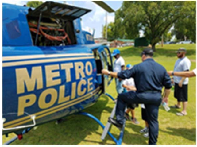
Lots of interest in helicopters. Future MNPD pilots?