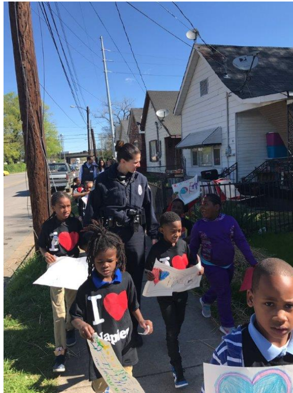
MNPD joins hands with Napier Elementary School for Peace Walk.