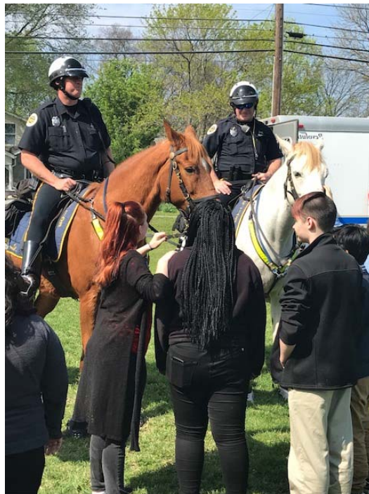
Wright Middle School Career Day

The Mounted Horse Patrol was a huge hit at the Sudekum Apartments' Spring Fling and Wright Middle School Career Day.