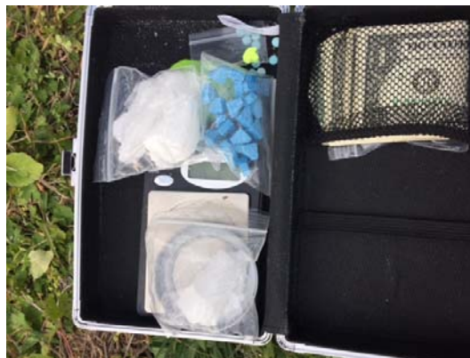
Seized meth and cash.

Specialized Investigations Division detectives seized 44 grams of meth, 24 ecstasy pills, one gun, and $1,410 cash. All the components for a meth lab were inside the house.