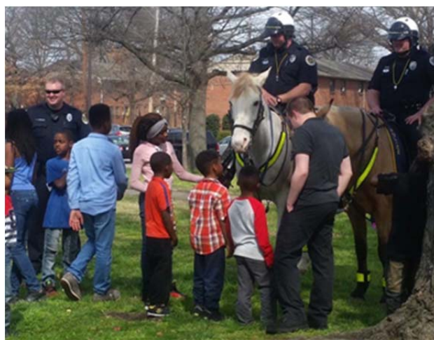
Sudekum Apartments Spring Fling