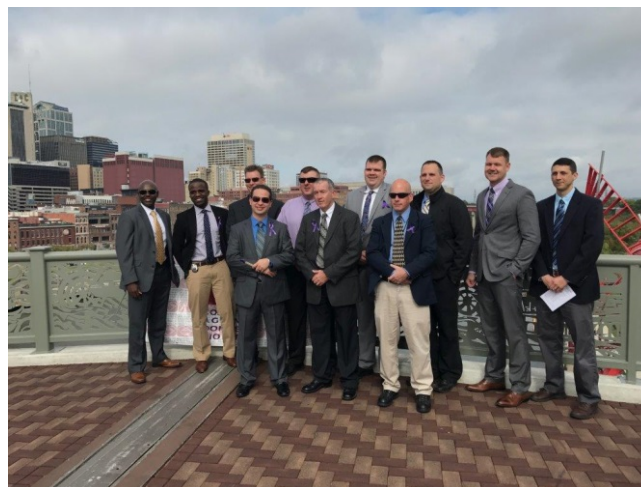
Domestic Violence Division detectives in attendance at Meet Us at the Bridge ceremony.