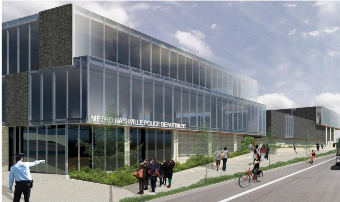
METRO NASHVILLE POLICE HEADQUARTERS + FAMILY JUSTICE CENTER

respect for police is at a near-record high. Gallup reports that 76% of Americans have “a great deal of respect” for police in their area, up 12 percentage points from last year. Earlier today, I spoke to the downtown Kiwanis Club. The sentiments of the persons there underscored the poll’s findings. Your collective efforts have earned the appreciation of this community. Thank you for working throughout Nashville to maintain the trust of our citizens.