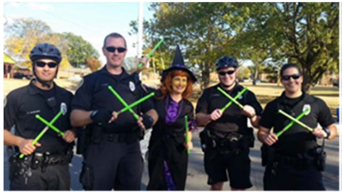
Officers participated in the activities with Nashville Pound Pro.