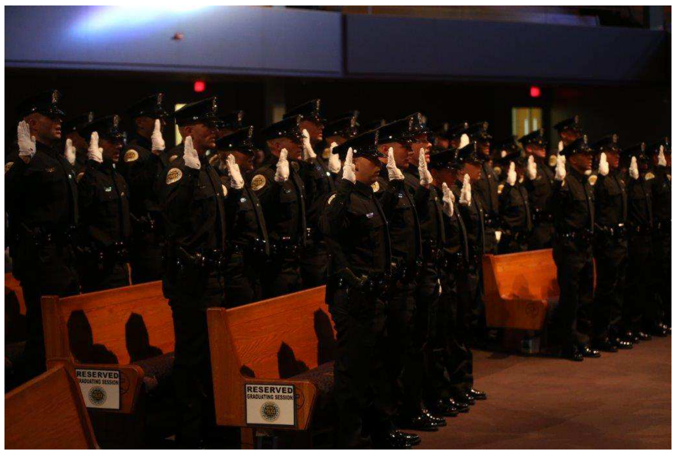
Mayor Barry administers the oath to Nashville's 40 new police officers.

The 40 new officers completed 22 weeks of training and will spend the next 5 to 6 months patrolling with Field Training Officers before policing on their own.