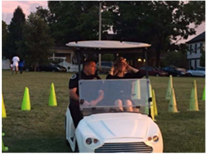
Mayor Megan Barry participated in a Traffic Unit demonstration in West Nashville.