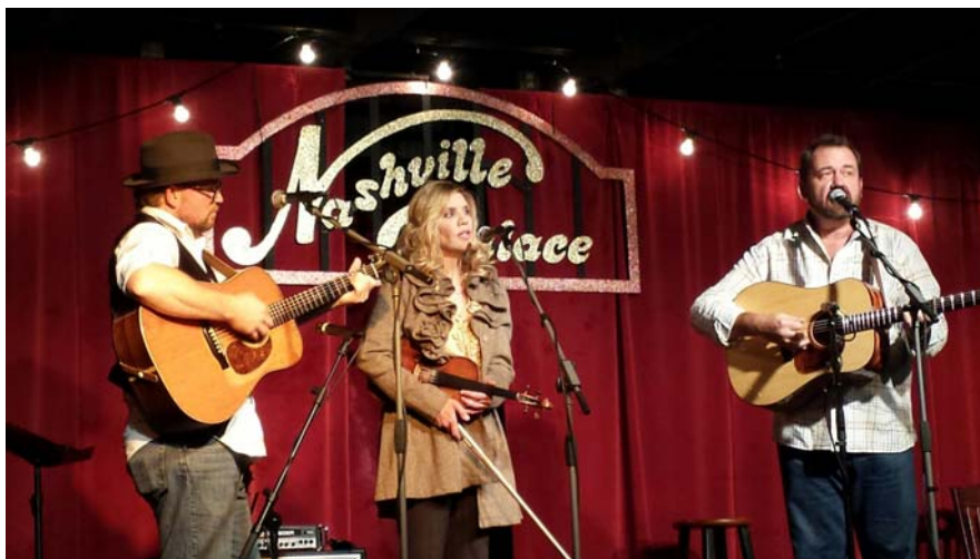
Special surprise guest Alison Krauss with Dan Tyminski