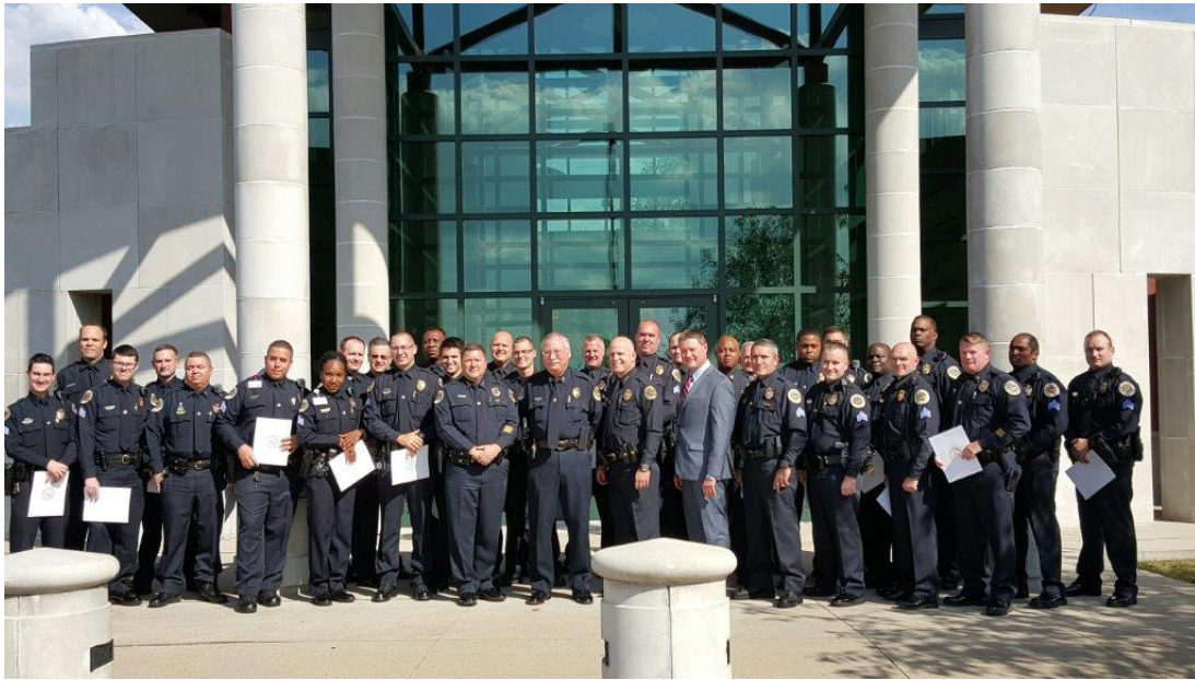
Promoted MNPD supervisors recognized during a ceremony at North Precinct.