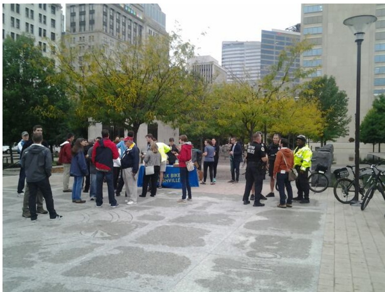
Participants assembled at Public Square Park.

The Central Precinct Bike Unit participated in the Mayor's Bike and Pedestrian Advisory Committee (BPAC) downtown walk to encourage bicycle and pedestrian safety/awareness.