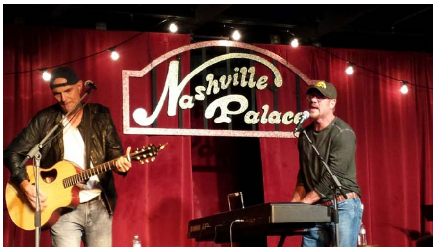
Special guest Phil Vassar on the keyboard