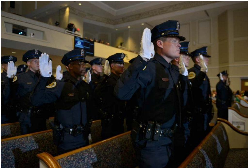
Mayor Dean administered the oath of office.

The sanctuary of First Baptist Church in Joelton was packed for the 6 p.m. graduation. The men and women of Session 77 have shown that they have the drive, desire and potential for long and rewarding careers serving the citizens of Nashville. Please congratulate and welcome them during your daily encounters.