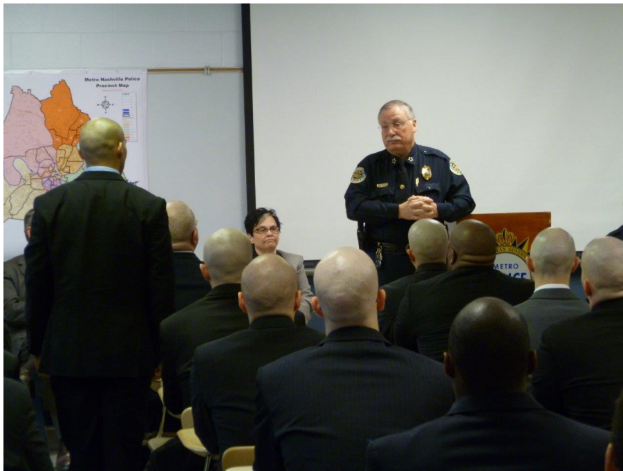
Chief takes questions