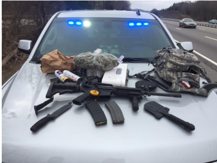
Seized marijuana and weapons