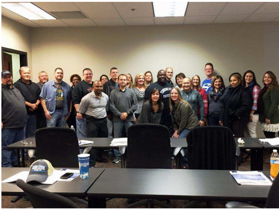
First-responders attend critical incident response training at Metro Southeast.

Attendees were certified in critical incident defusing and debriefing techniques and qualified to assist the Behavioral Health Services Division in responding to critical incidents as they occur.