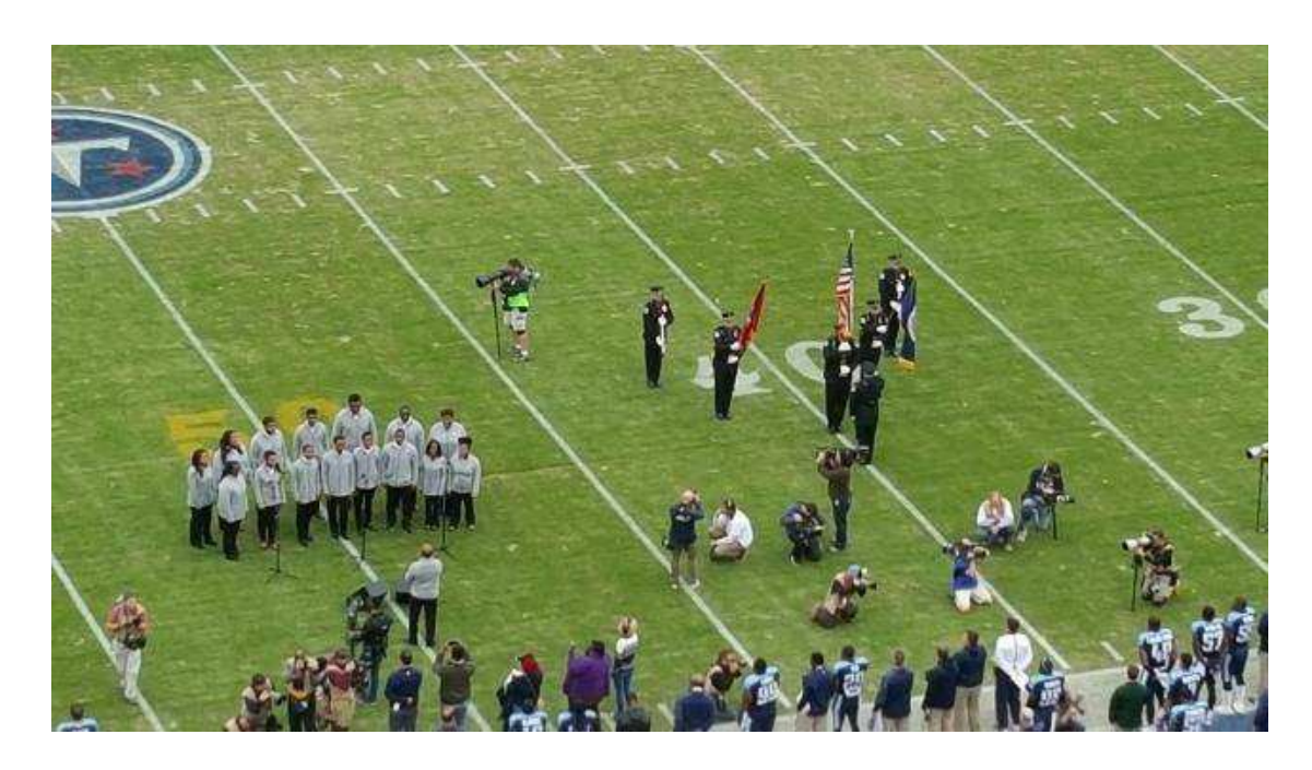
Veteran's Day Parade

The MNPD Honor Guard presented the colors before kickoff at the Tennessee Titans versus Jacksonville Jaguars football game at Nissan Stadium as the Fisk Jubilee Singers performed the National Anthem.