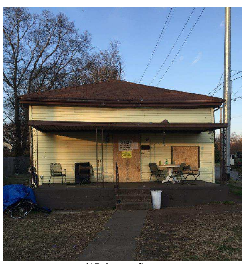
66 Robertson Street