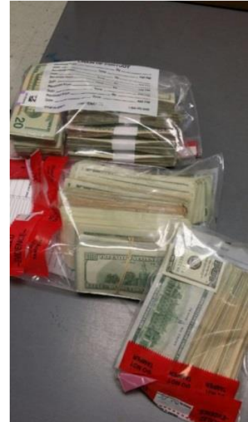
Seized machines & Cash

A two-month investigation into the distribution of heroin in the South Nashville, Brentwood and Franklin areas culminated in the arrest of four persons, including one buyer who ingested balloons containing 8 grams of heroin as police moved in.