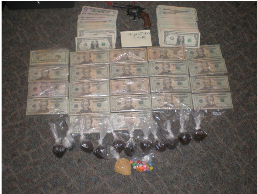
Seized heroin & cash