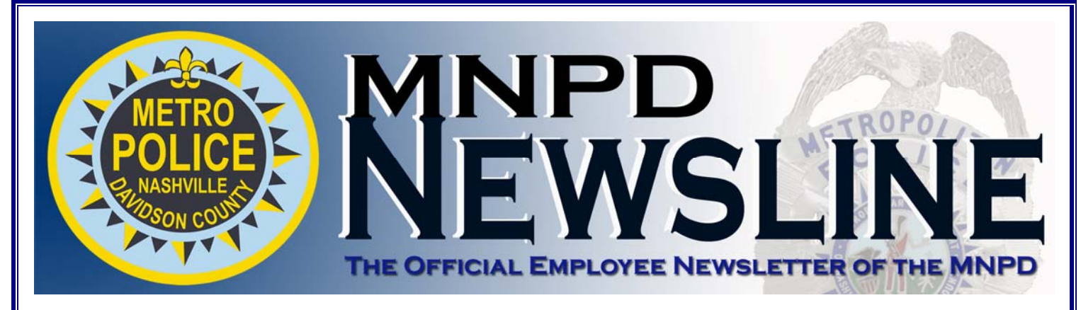
May 22, 2014