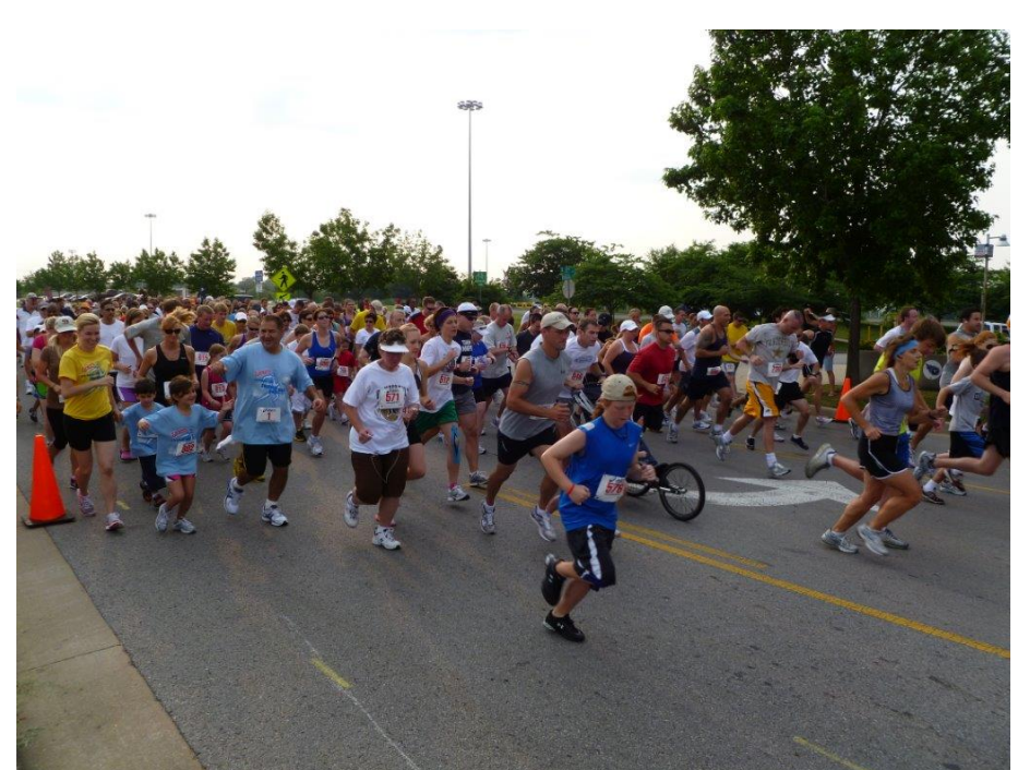
Shoney's 5K Family Fun Run benefiting the MNPD is June21