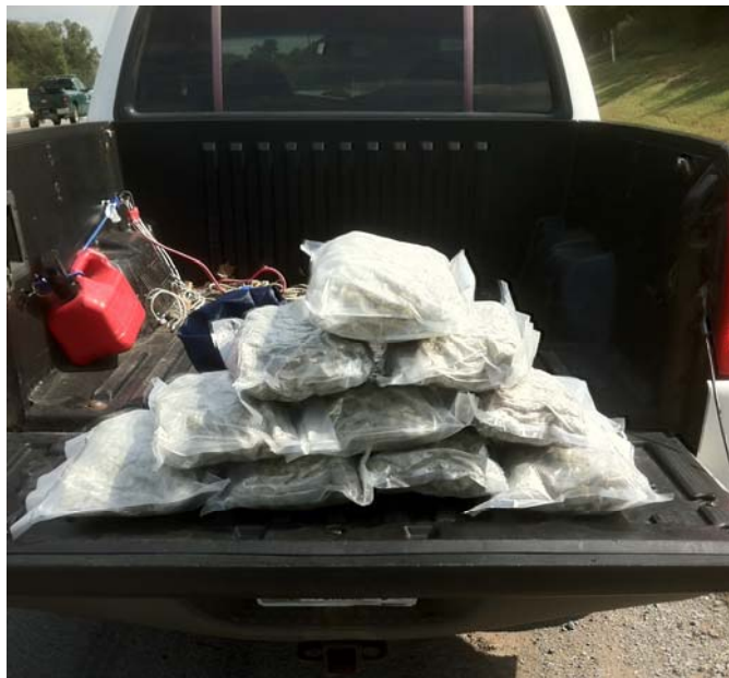
Ten one-pound bags of high grade marijuana

Gamby is charged with possession of marijuana for resale. He is being held in lieu of $10,000 bond.