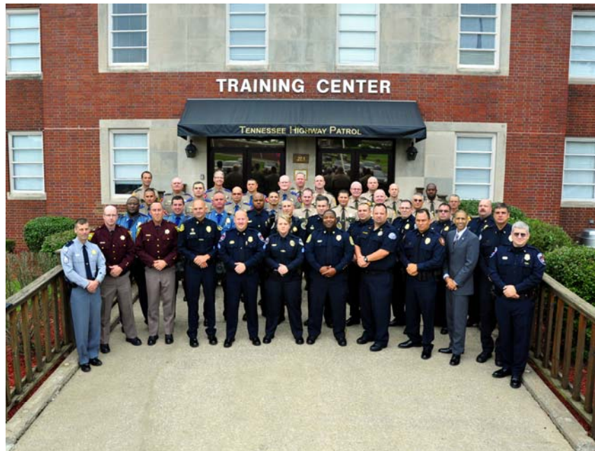
Northwestern University School of Police Staff and Command graduates