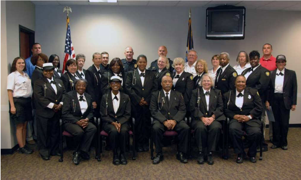
New School Crossing Guards pictured with police support staff and supervisors