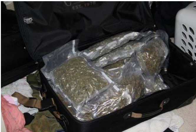
Seized high-grade marijuana