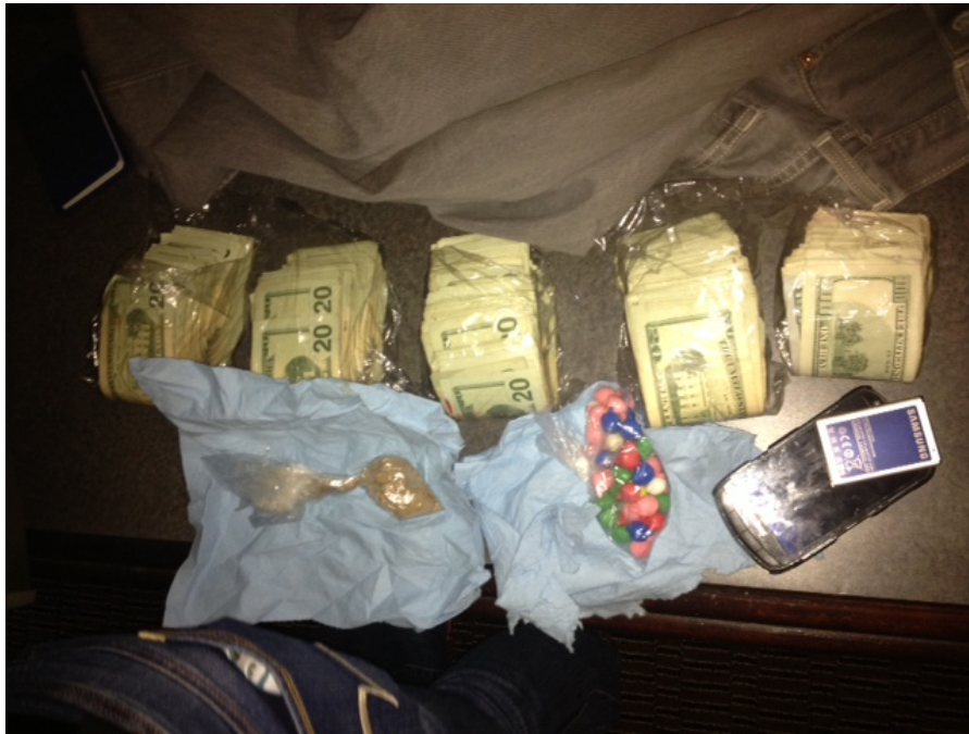
Seized heroin & cash