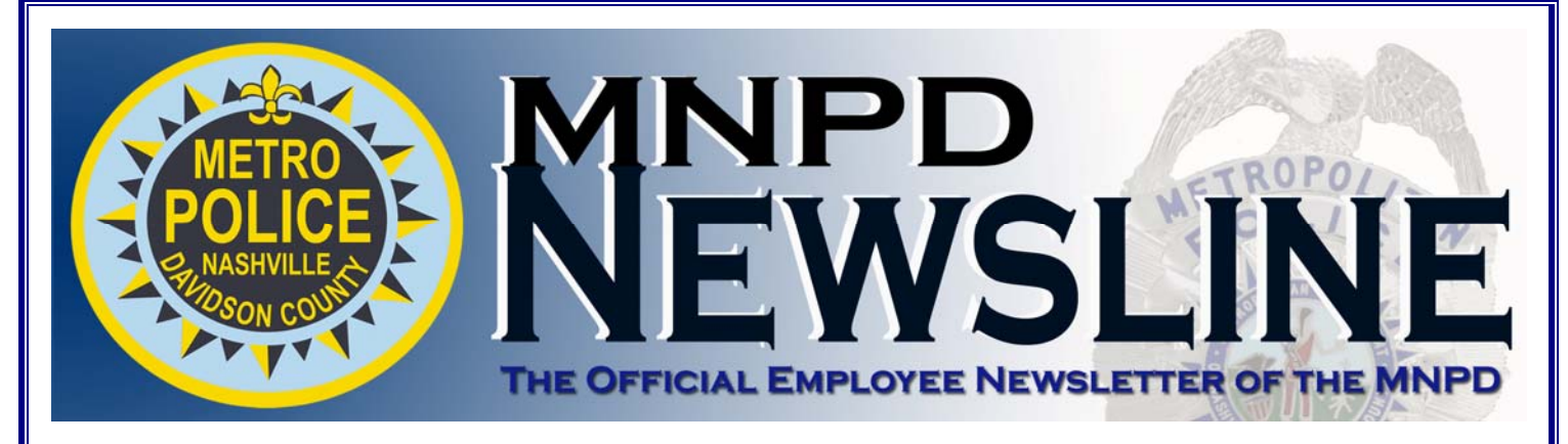
June 12, 2013