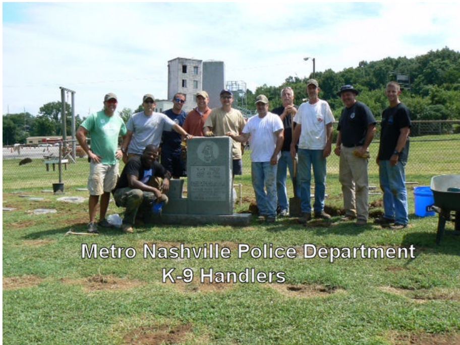
Metro Nashville Police Department K-9 Handlers

Each Cub Scout and Boy Scout will receive community service project hours that go towards their next rank advancement and a summer service project patch within the Scouting Program.