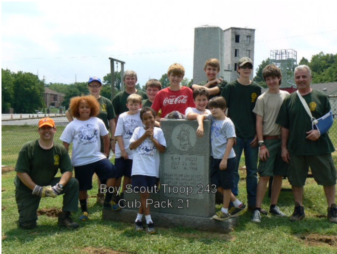
Boy Scout Troop 243 Cub Pack 21