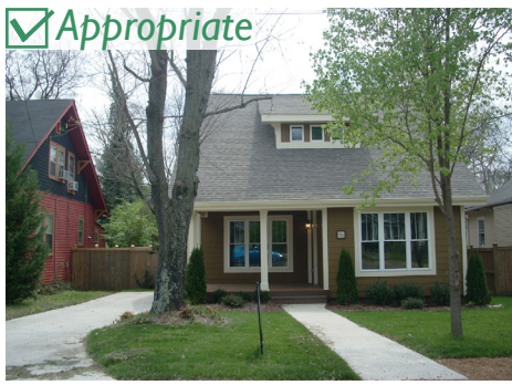
Example of a newly constructed 1 \ 1/2 story home with a single width driveway.