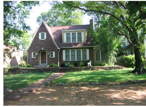
General character of existing housing.