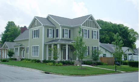
This 2 story house does not maintain the height and scale of the Primrose neighborhood.