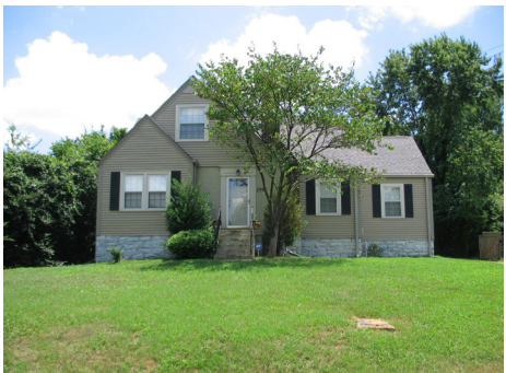
Most of the homes are 1 to 1 \ 1/2 stories.