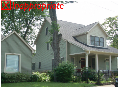
This house meets the lower eave height standard (B) but is too tall for the maximum height standard (A).