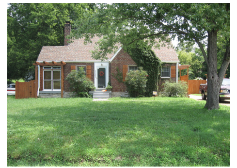
General character of existing housing.