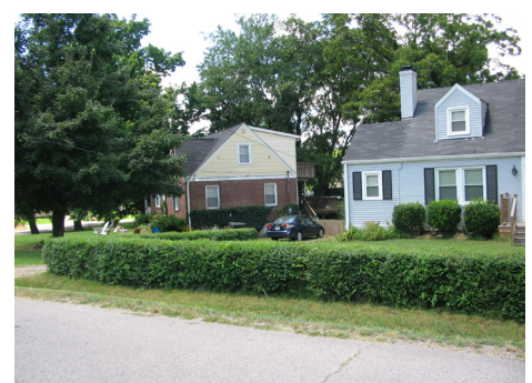
Many of the homes have been expanded by raising the roof on the back of the upper floor.