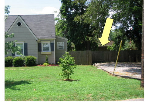
Lots abutting 440 on Primrose Circle have been constrained by the loss of their rear yards.