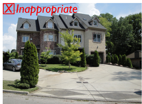
In addition to being too tall, additional parking pads are not permitted in the front yard and driveways are to be 12' maximum.