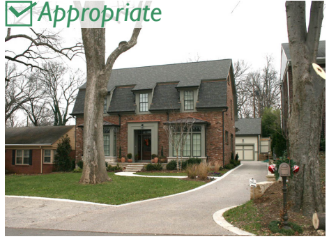
Other roof forms such as a gambrel roof are possible as long as they meet the lower eave and maximum overall height requirements.