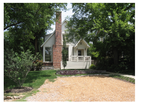
Compatible infill, 1 1/2 story.

This Urban Design Overlay (UDO) has been created to maintain the scale of the existing homes. The UDO is not intended to dictate style or require new construction to exactly replicate the existing homes. The standards of the UDO focus primarily on the front of the house and yard - through the standards for height, setbacks and driveways/ garages.