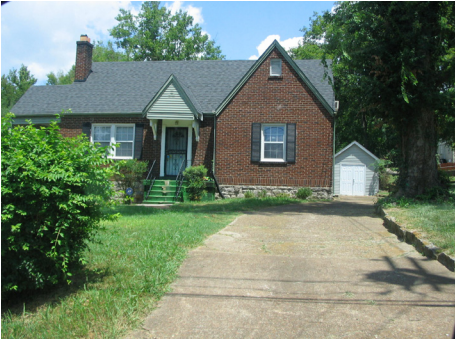
Driveways are typically 8-12 feet wide.