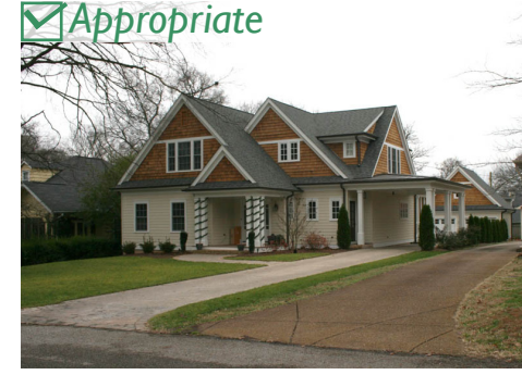
This example has a complicated roof line, but still meet the standards for height. Additionally, the garage is located to the rear.