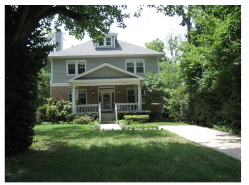
Two story infill is present in the neighborhood, though not common.