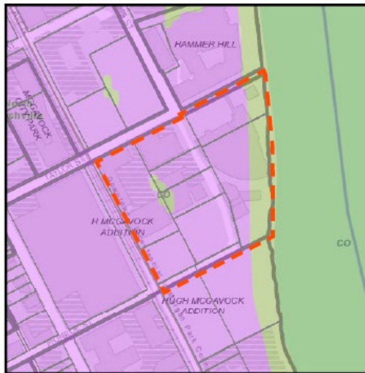
FIGURE 1: SUPPLEMENTAL POLICY BOUNDARY

North Nashville's Urban Mixed Use (T4-MU) Area 08-T4-MU-03 applies to properties bounded by Taylor Street to the north, Monroe Street to the south, the Cumberland River to the east, and 1 st Avenue North and the Cumberland River Greenway to the west. These properties were once home to the historic Neuhoff Meat Packing Plant. In this SPA (shown in Figure 1), the following policies apply. Where the SPA is silent, the guidance of the T4-MU policy applies.