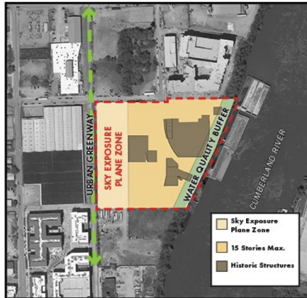
FIGURE 2: HEIGHT / SKY EXPOSURE DIAGRAM