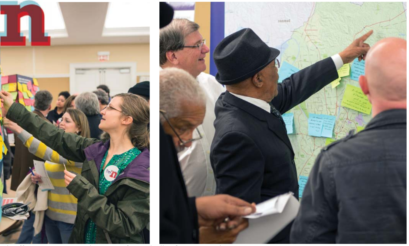
Kick-Off participants write their vision for Nashville's future on sticky notes. They used dots to show agreement with other participants' ideas.