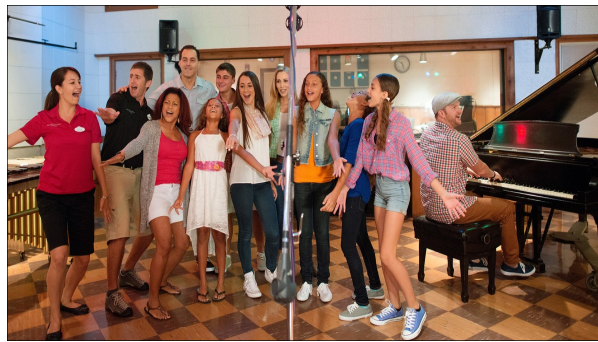
Tour group at RCA Studio B.