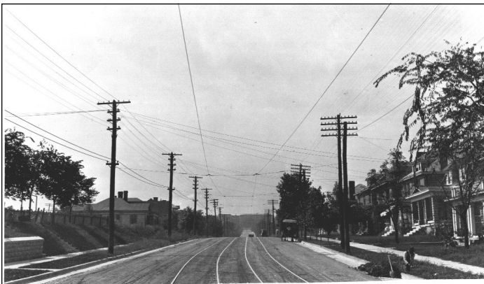
16th Avenue South. Looking toward Belmont University. Circa 1906.

The neighborhood's built environment dates to the late 19 th century when it developed as a streetcar suburb, but it is the area's unique role over the past 60 years as the center of Nashville's music industry that defines its transformative impact on national and international culture. Although the neighborhood has experienced considerable redevelopment in recent years, Music Row continues to retain its historic sense of place and distinctive character, based primarily on the resilient and spirited community of music industry businesses that support Nashville's economy.