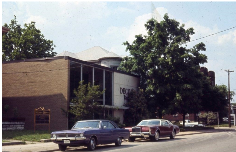
Decca Records, Opened 1962 on 16th Ave. S..