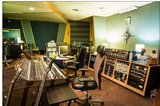
Maintaining up-to-date equipment is a major expense for Music Row's recording studios.

Another aspect of this sales tax waiver program could apply to purchases made by any music-related business within the Music Row Cultural Industry District for the purposes of enhancing or growing their business, such as for equipment, interior renovation (that meets guidelines for rehabilitation), technology infrastructure, and related business investments. Again, such incentive programs could be extended to other special business districts created in the city. A tax exemption program of this type in some ways mirrors a similar tax credit (1% to 5%) program instituted by the State (see below) for purchase of large machinery and equipment with a certain investment value.