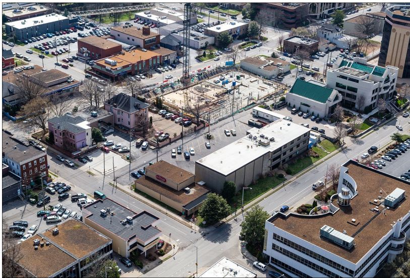
Music Row, 2015.