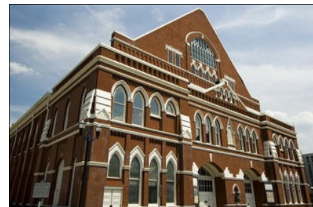
The restored Ryman Auditorium features performances and tours.