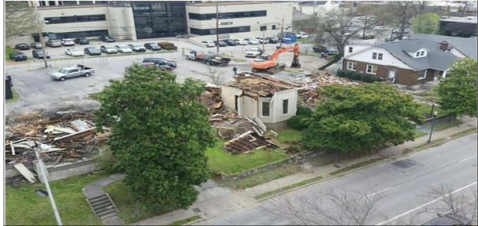
Demolition on 17th Avenue South, March 26-27, 2015.

Music makes Nashville unique, and it's important that we think carefully about how Music Row, a historic and iconic area in our city, gets developed.