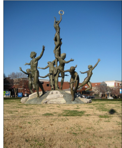
Musica was unveiled in 2003.