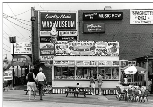
Tourists flocked to museums and souvenir shops on Demonbreun Street from the late 1960s through the 1990s.

In 1978, a new tourism attraction opened, the Webb Pierce Hall of Fame for Country Music Fans. Tourists could see a guitar-shaped swimming pool and meet country singer Webb Pierce for the price of $2. (The attraction closed in 1979, and the pool is now part of Spence Manor Condominiums.)