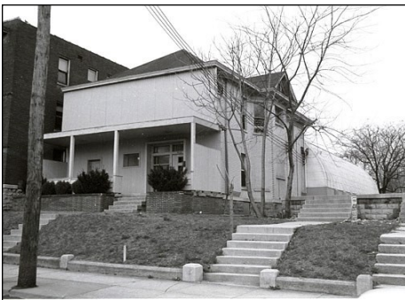
Bradleys’ Film and Recording Studio, late 1950s, 16th Ave. S.

As noted in “How the Arts and Culture Sector Catalyzes Economic Vitality,” a report by the American Planning Association” “Terms such as ‘creative economy,’ ‘creative class,’ and ‘cultural economy’ are becoming common among urban planners, arts administrators, economic developers, and business and municipal leaders.” (4) The report goes on to describe “facility-centric” and “people-oriented” options: “Economic development approaches that integrate arts and culture are usually combinations of facility-centric, people-oriented and program-based approaches.”