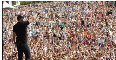
CMA Music Fest is one of many music events which attract visitors to Nashville throughout the year.

"The Promise of Nashville, where the music is inspired, created, recorded and performed, is to provide the ultimate musical entertainment experience, celebrated throughout our diverse cultural and entertainment offerings, and presented in an authentic, unique, friendly and unpretentious atmosphere."