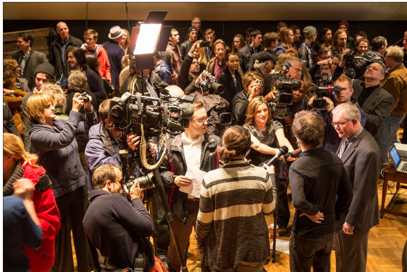
National Treasures announcement, January 2015.