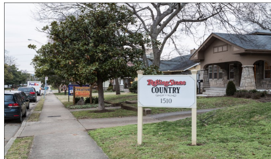
Many music –related businesses operate out of historic homes.

A net result of development pressures can be the loss of important Music Row heritage (such as what might have occurred to RCA Studio A) and/ or the loss of music-based businesses that otherwise comprise this important economic cluster. Unchecked demolition has created gaping holes along entire blocks of Music Row and can reduce the competitiveness of Music Row for attracting and retaining the smaller businesses that thrive in small historic homes, and reduce the historic ambiance of those sections of Music Row that retain some sense of the early, heady years of the music industry.