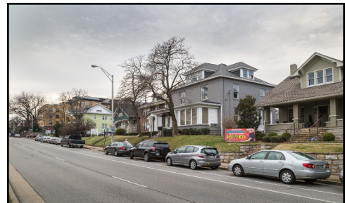
Streetscape, open space, signage, gateways and other elements are an important part of Music Row’s environment.

Streetscape, parks, open space, unique signage, gateways and building treatments can be employed to strengthen Music Row as a unique district with its own character. Some of these features already exist and there are efforts underway to add value. Streetscape planning should include plans for the alleyways which serve as a traffic route and entrance point for many offices. Currently the alleyways are unattractive with paving in disrepair and with no streetscape elements such as curbs, signage or landscaping. Metro Arts Commission might offer technical assistance or sponsor a design competition within the district for businesses that are interested in enhancing their business signage. Signage codes could enable creative and interesting business signage within the district for businesses that have taken advantage of the technical assistance as part of a “carrot and stick” approach (similar to other regulatory incentives).