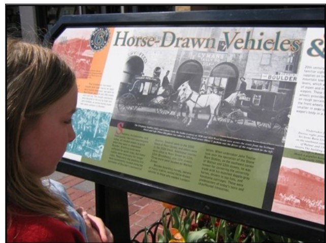
Interpretive signs are an effective way to tell the story of historic places.