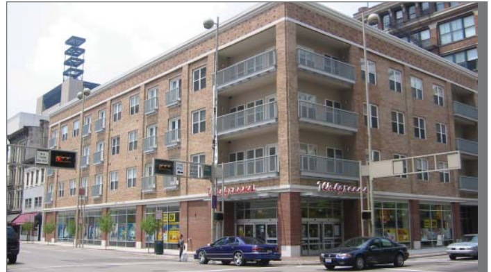
Building facade at the edge of the sidewalk to engage the public realm and create a pedestrian-friendly environment

Building Height – Mixed-use, non-residential, and residential buildings rise up to 15 stories in height, unless a mandatory Urban Design Overlay is in place with appropriate design standards to ensure a pedestrian-friendly, cohesive development pattern that