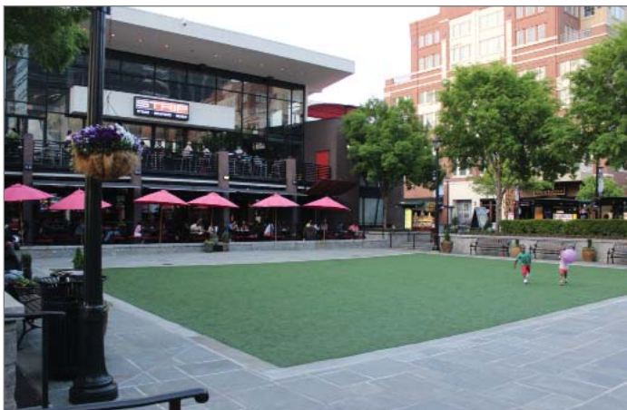
Open space in T5

Additional policy guidance for any of the sections below may be established in a Community Plan or Detailed Plan. Please refer to the applicable Community Plan or Detailed Plan for the site in question to determine if there is any additional policy guidance.