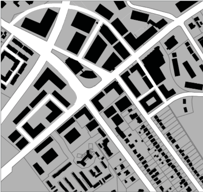
T5 Regional Center