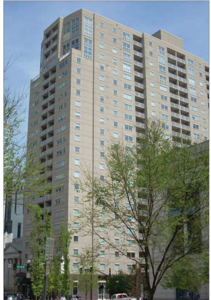
Range in building height in a Center

Parking – Parking is provided on-street or on-site in structures or surface lots. Structured parking hidden from view with liner buildings is preferred. Whether structured or surface, parking is located behind, beside, or beneath the primary building with one row of parking allowed between all buildings (including outparcels) and the street. If parking is located in front of the primary