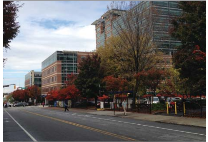
Parking located to the side and screened from the street