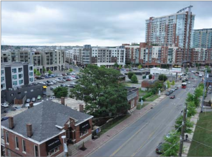
Using Centers to the highest extent possible

Roadway design for corridors also contributes to a welcoming pedestrian space. Corridors accommodate on-street parking, street trees, and active street-level uses. As a result, residents and visitors move about freely on foot, bicycle, automobile, or mass transit. In addition, a more compact block structure and a highly connected street pattern makes multiple transportation modes attractive and efficient.