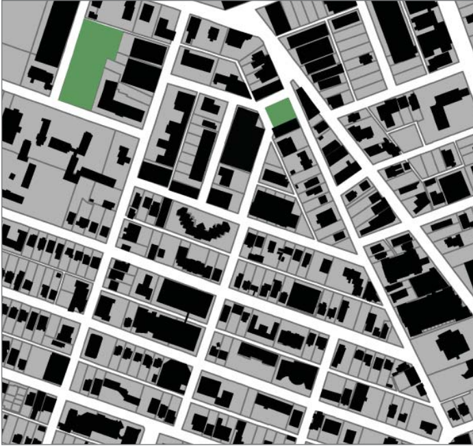
T5 Open Space