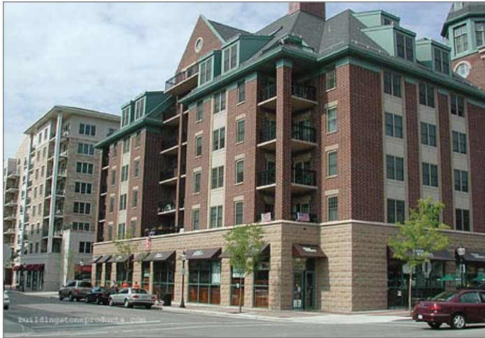
Massing and orientation of a building in T5 with distinction between the public and private realm

The intensity of non-residential development is high with mixed use, office, commercial, and some forms of light industrial uses in buildings ranging from two to greater than 20 stories in height. Future building heights are based on the building type, surrounding context, architectural elements, and location within the T5-MU area.