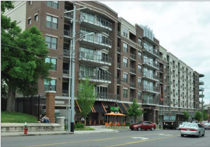
Formal landscaping with tree wells

Landscaping or structural treatments such as walls are used to screen ground utilities, automobile-related uses, meter boxes, heating and cooling units, refuse storage, and other building systems that would be visible from public streets. Fencing and walls that are along or are visible from the right-of-way are constructed from materials that manage property access and security while complementing the surrounding environment and furthering Community Character Manual and Community Plan urban design objectives. Landscaping and/or trees are one means to screen surface parking and structured parking.