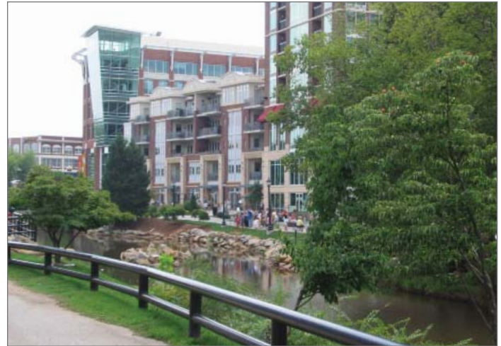
High lot coverage and a strongly articulated facade

Building Type – A mix of building types is expected in T5-RG areas with preference given to mixed use buildings. These buildings use land efficiently and contribute to the vitality and function of the center by providing combined opportunities to live, work, and shop and by supporting both consumer business viability and