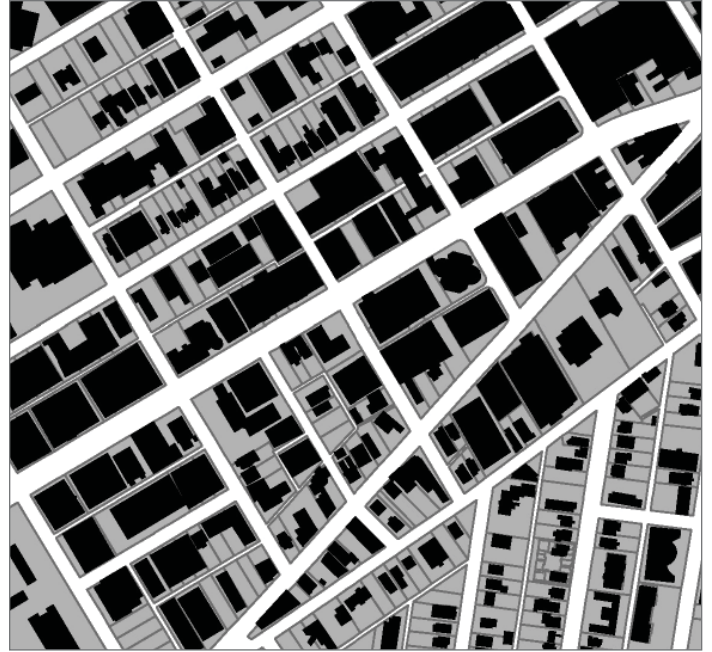
T5 Mixed Use Neighborhood