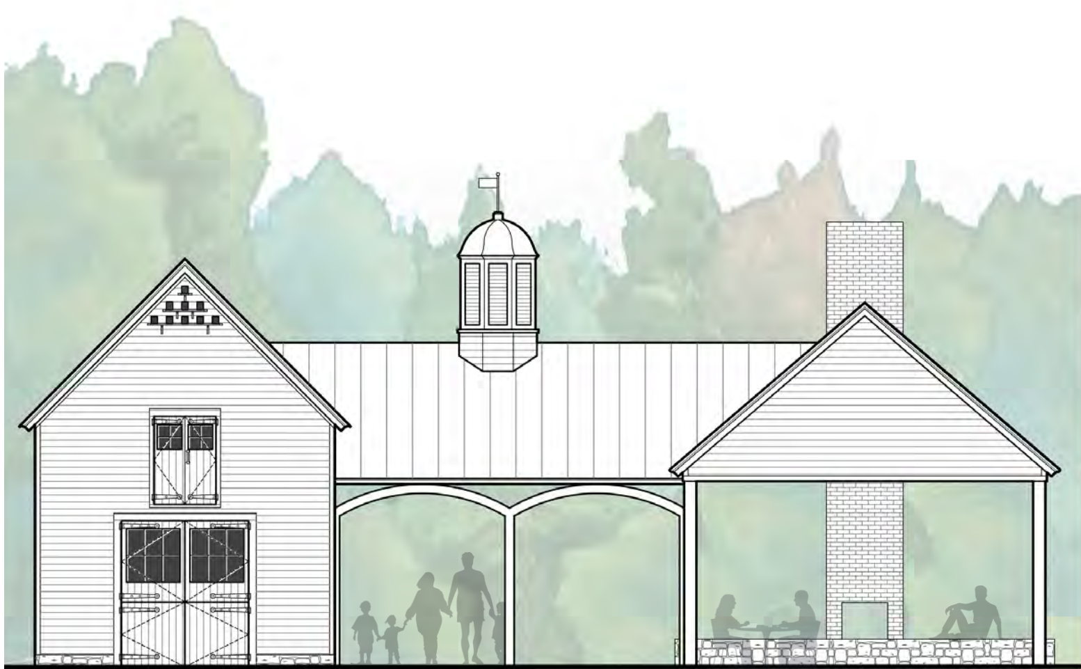
CARRIAGE HOUSE - NORTH ELEVATION