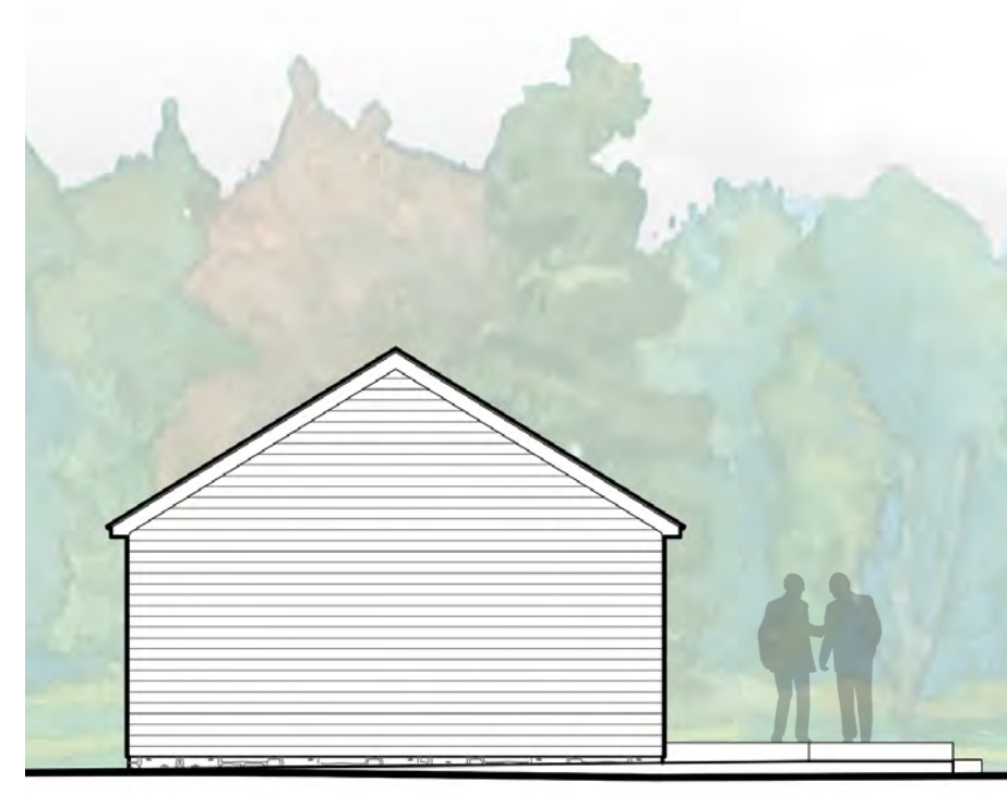
RESTROOMS - NORTH ELEVATION