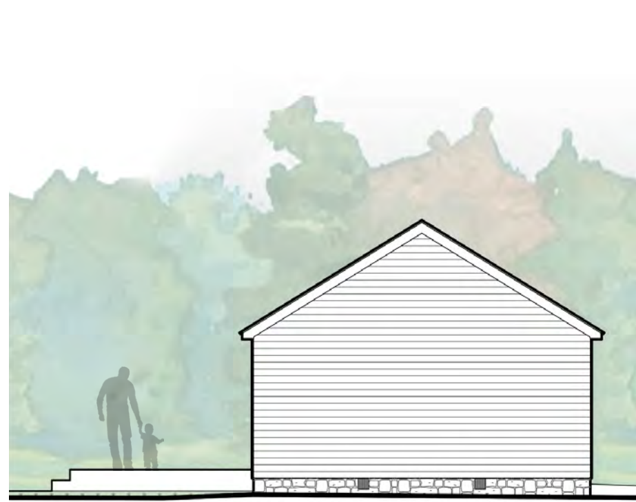
RESTROOMS - SOUTH ELEVATION