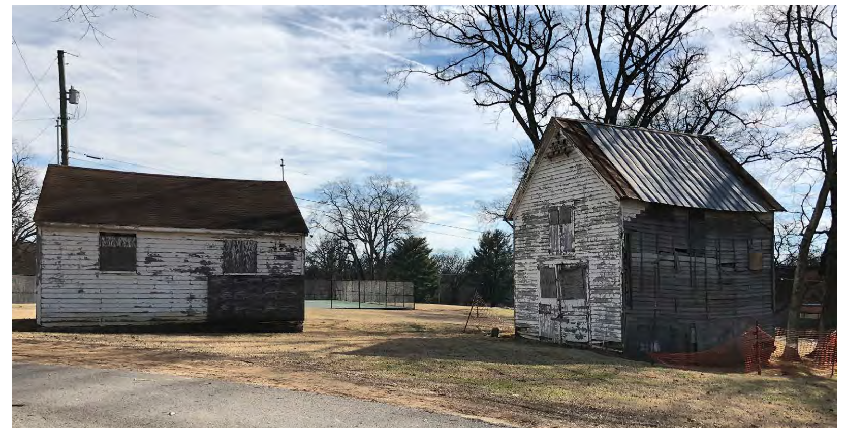
CARRIAGE HOUSE & OUTBUILDING - PRESENT CONDITIONS