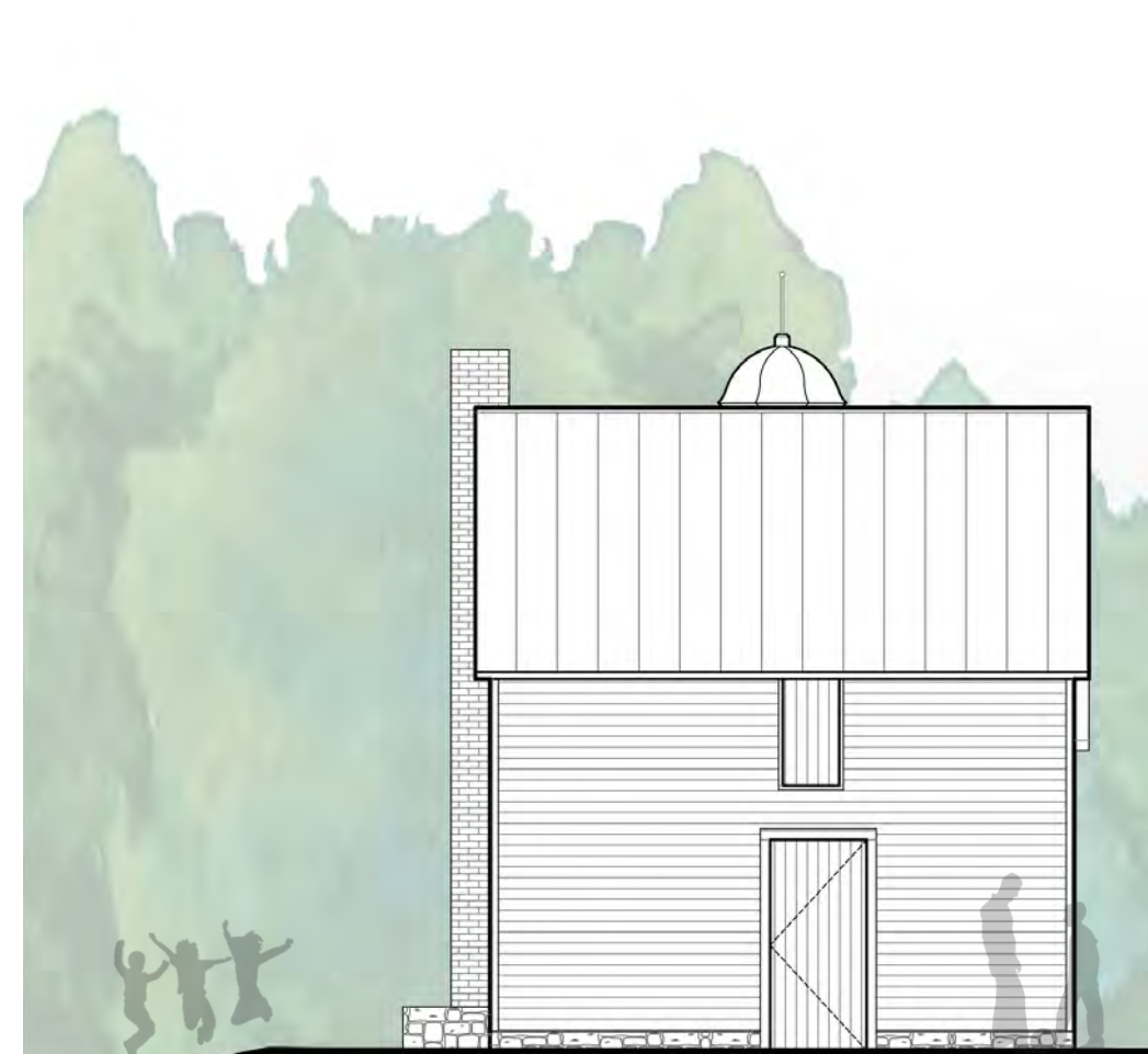
CARRIAGE HOUSE - EAST ELEVATION