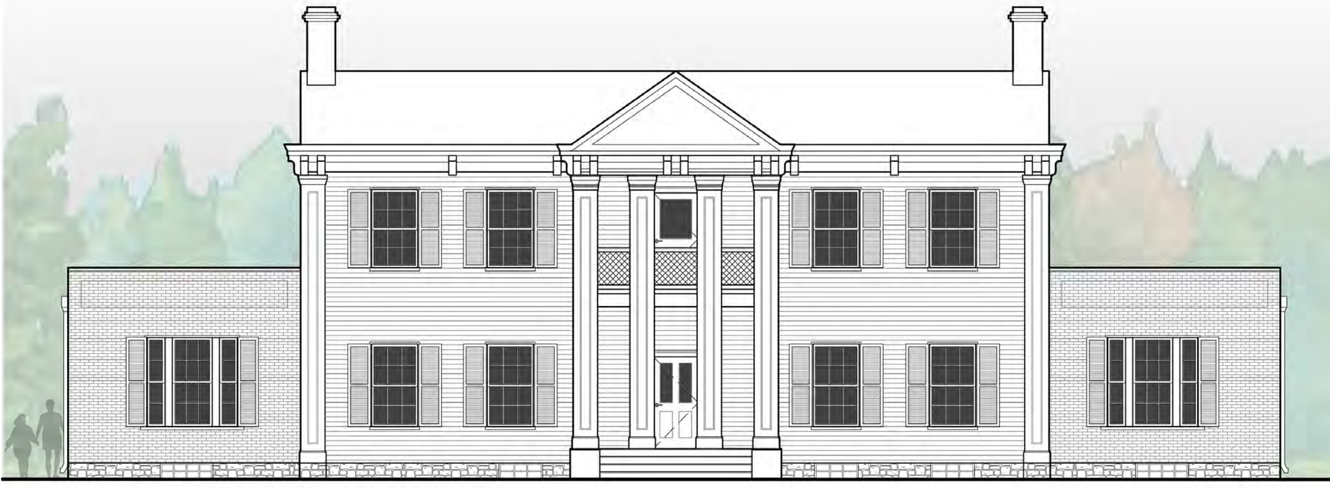
SUNNYSIDE - EAST ELEVATION