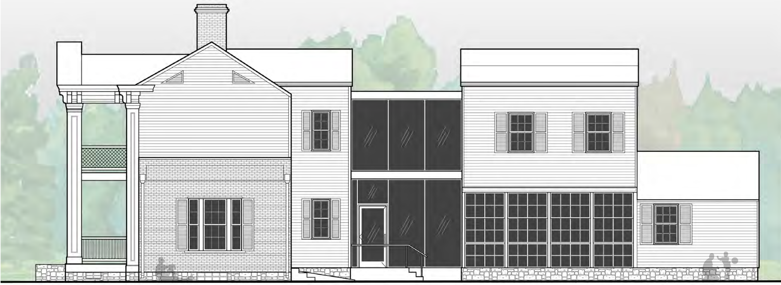
SUNNYSIDE - SOUTH ELEVATION