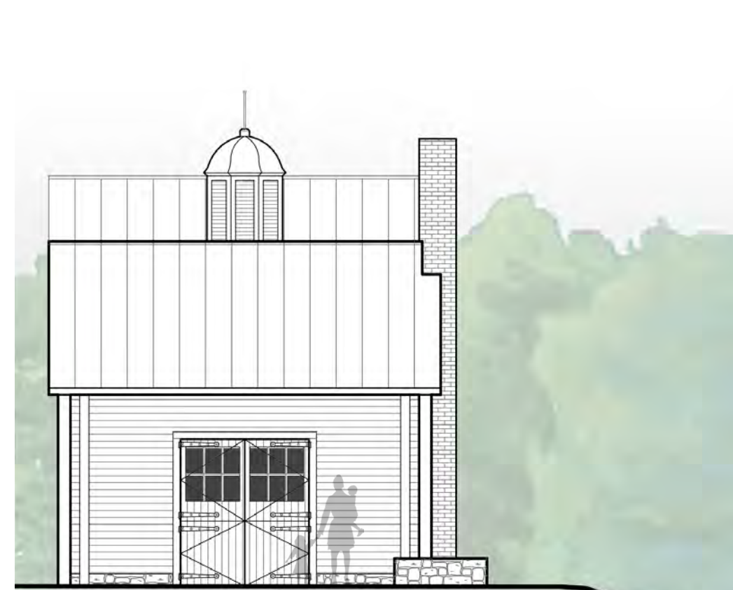
CARRIAGE HOUSE - WEST ELEVATION