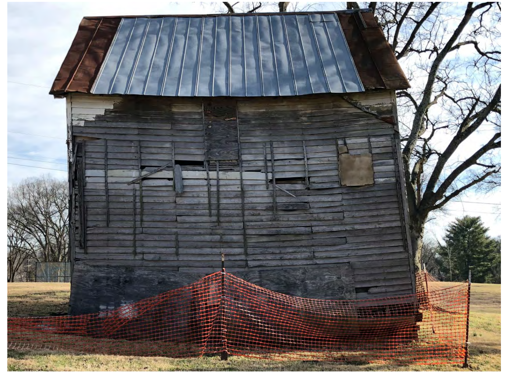
CARRIAGE HOUSE - PRESENT CONDITIONS