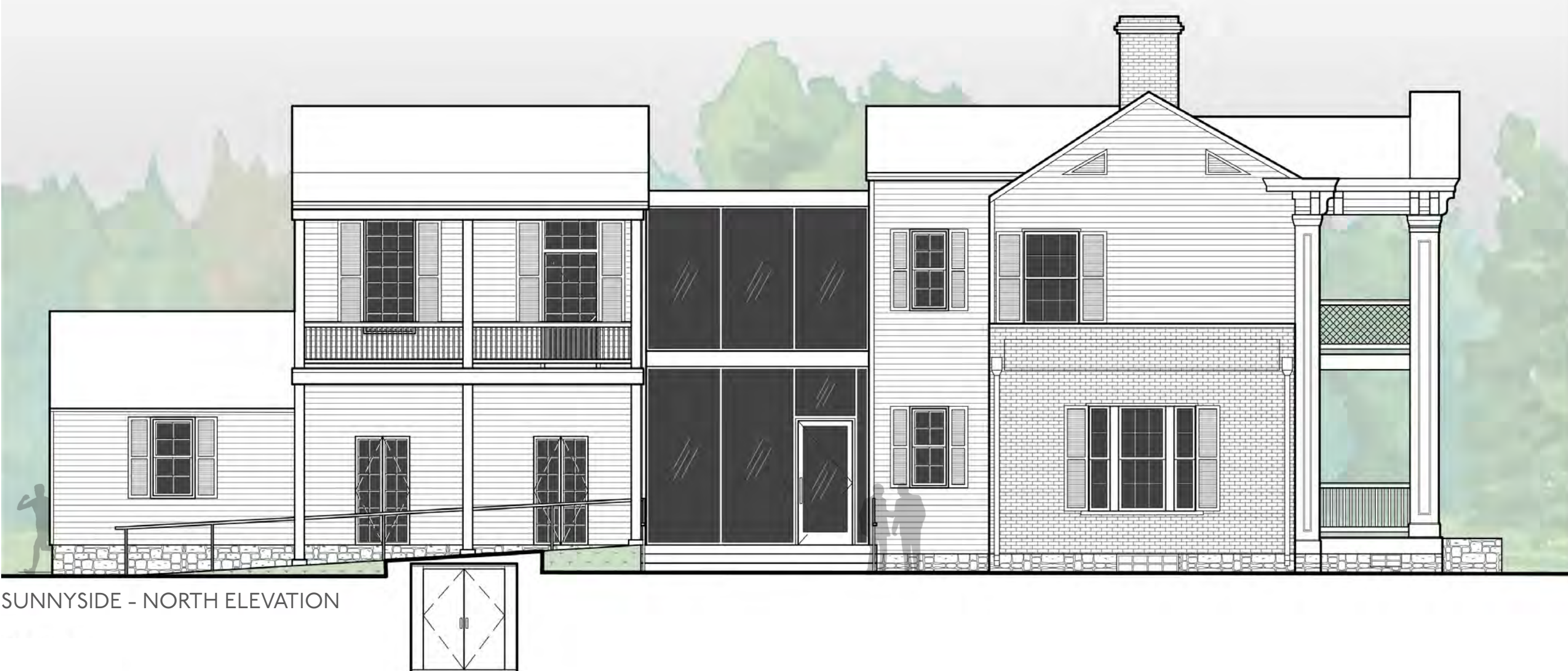
SUNNYSIDE - NORTH ELEVATION