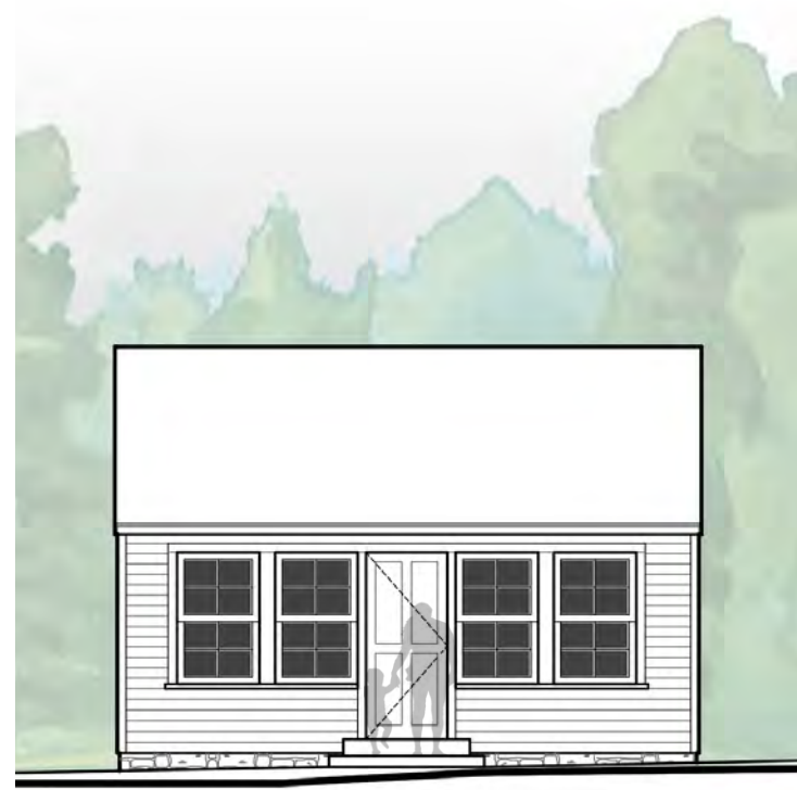
RESTROOMS - EAST ELEVATION