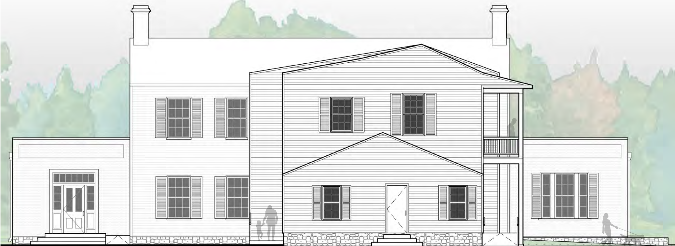
SUNNYSIDE - WEST ELEVATION