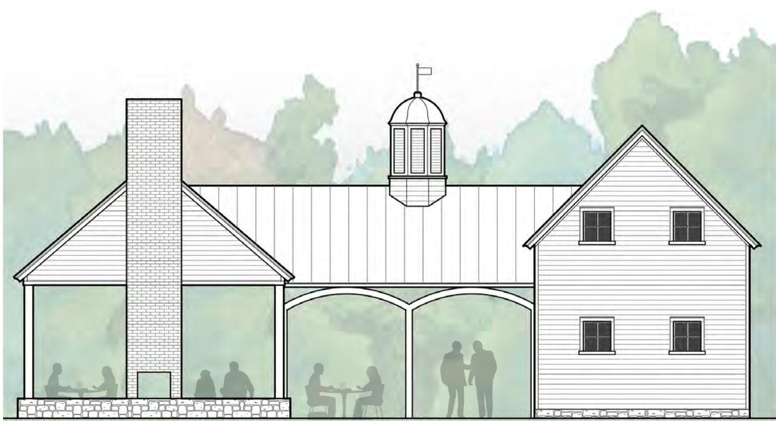
CARRIAGE HOUSE - SOUTH ELEVATION