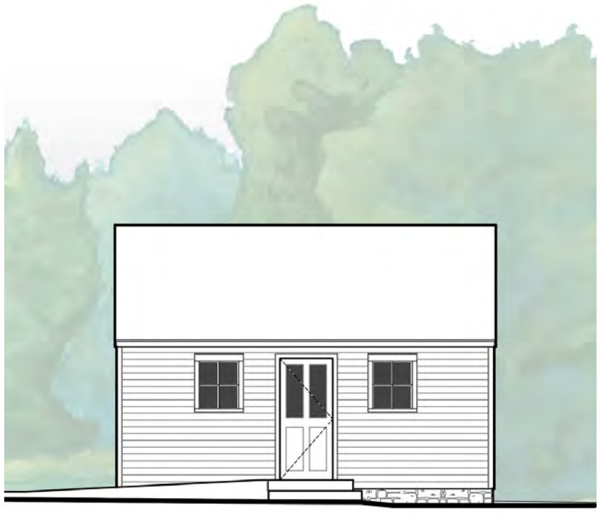
RESTROOMS - WEST ELEVATION