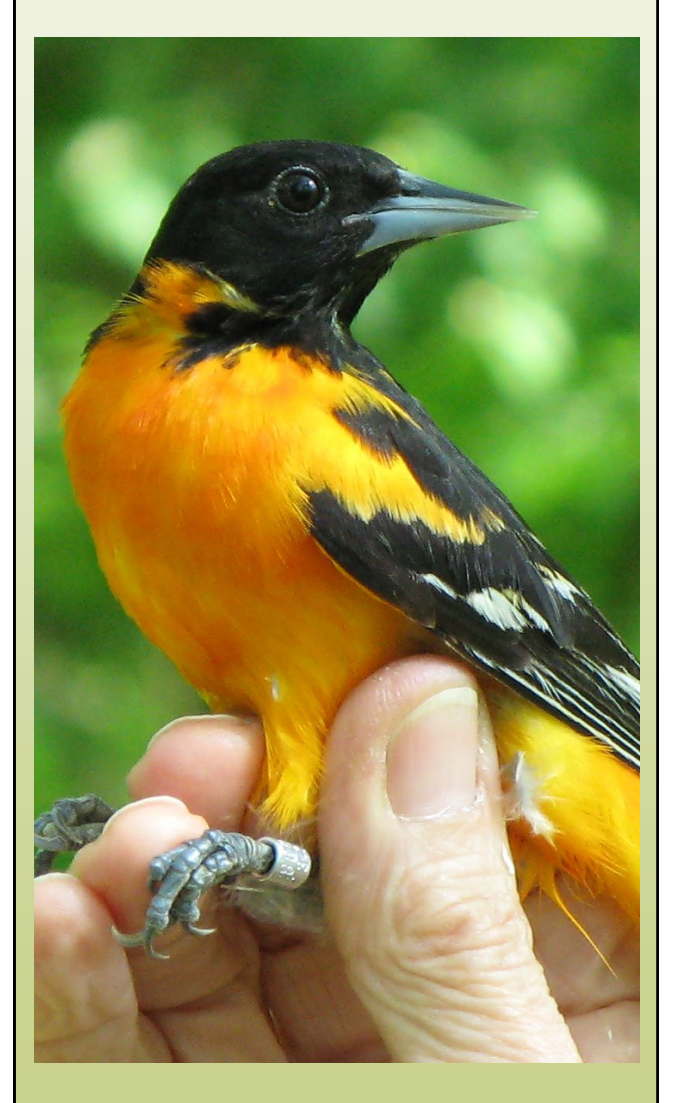
Discovery taking flight!