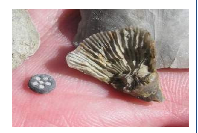
Though typical of those found here, fossils depicted in this picture were not found at Fort Negley

Although it is hard to image, 450 million years ago a vast ocean teaming with life covered most of the eastern United States including Tennessee. Today, reminders of this ancient past remain in Nashville's rocky landscape. Limestone forms in warm shallow seas as calcium carbonate shells and debris accumulate over millions of years. As the limestone forms, the remains of dead creatures become trapped between layers of sediment. Over time, minerals replace the decaying body or shell leavening a copy or a fossil. Fossils may remain hidden for centuries. During the 1930s, Works Progress Administration Workers revealed huge coral fossils at Fort Negley while quarrying new stone from the hillside. These fossils remain exposed offering insight into the geologic past. Interested in learning more about Nashville's former life as a tropical sea?: Visit Fort Negley! For more information on related programs, see page 4.