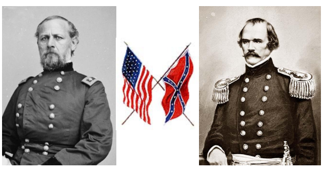
Gen. Don Carlos Buell