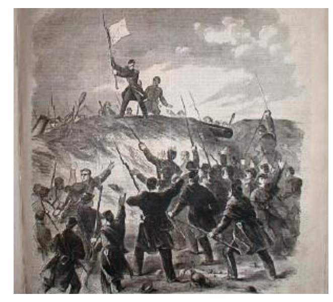
"The Surrender of Fort Denelson [sic] February 16, 1862" Harper's Weekly March 1, 1862

Pastors dismissed their congregations and panic broke out in the streets of Nashville as citizens questioned an uncertain future.