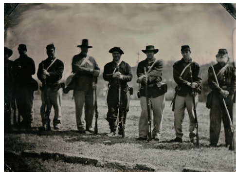
Alumatype of the 9th Kentucky Volunteer Infantry Regiment, USA, Co. B

Events at Fort Negley are becoming more frequent and are getting better and better. Keep checking the newsletter for upcoming events and visit our Facebook page for more details. Also, feel free contact us at any time at (615)862-8470.