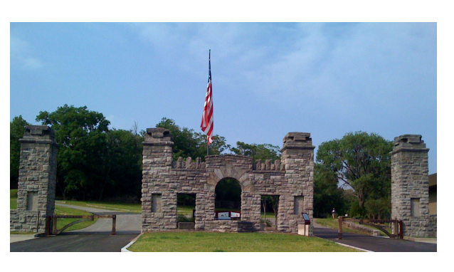
Entry Gates Constructed by the WPA

Tennessee rejoined the Union in July 1867. Union forces occupied Nashville and Fort Negley until September. At that time, the army dismantled the majority of Nashville's defenses.