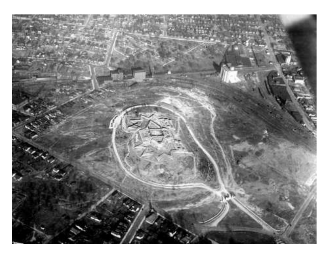
Arial View of Fort Negley, 1937

In 1936, 800 men working for the WPA (Works Progress Administration) reconstructed Fort Negley at a cost of $84,000. The Fort reopened to the public in 1938. In the 1960s, Metro Parks removed the deteriorated stockade and closed the Fort to the public.