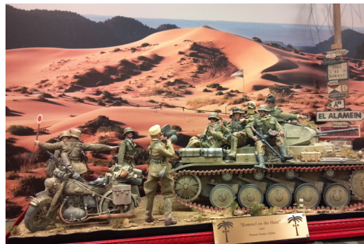
"Rommel on the Hunt" by Todd Jackson

Artistry and ingenuity were on display Saturday, July 28 at Fort Negley at the Battle of Nashville Preservation Society Model Show. Models of all sorts, from single planes to battlefield diorama, were on display. Exhibits were open to the public from 10:00 am to 3:00 pm giving visitors ample opportunity to enjoy the displays and vote for their favorite. Model categories included American Civil War Infantry—Union or Confederate; American Civil War—Mounted or Artillery; Dioramas—Open, Any Era; Open—All other eras, Mounted, Foot, Ordnance, Armor/ Military Vehicles. The show was well attended and everyone agreed it was a good representation of the modeler's art.