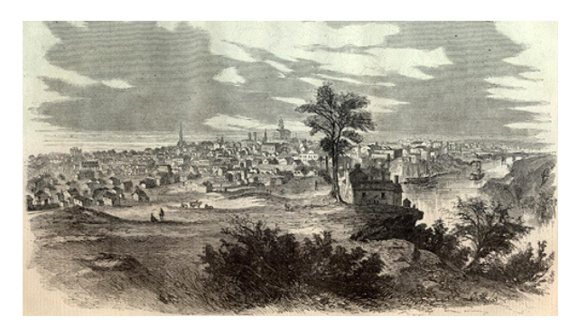
Nashville, Tennessee Harper's Weekly March 8, 1862

Special Dispatches sent between February 12 and 15, 1862 reported certain Confederate victory at Fort Donelson. On Sunday, February 16, that confidence was shattered and panic erupted as people learned of the Confederate Army's defeat. For nearly two weeks, Nashvillians awaited the Union Army.