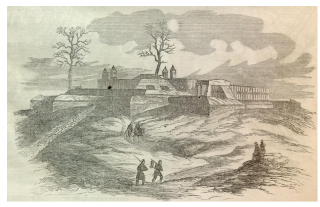
Fort Negley, Nashville. October, 1862. Harper's Weekly, January 10, 1863