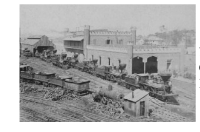
Nashville Chattanooga Rail Depot

Union forces held firm control of Nashville's civilian population and transformed the city into a vital forward base of operations in the campaign to capture Chattanooga and Atlanta.