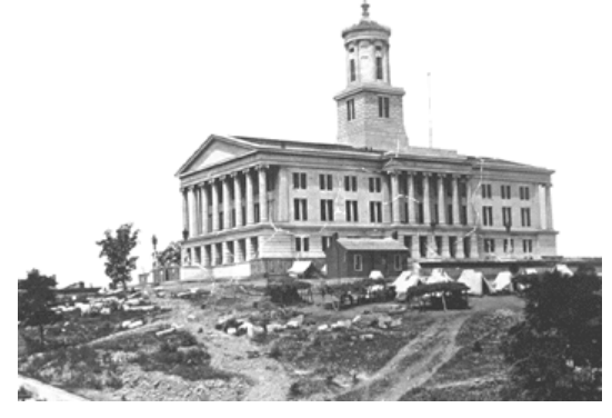
Union Encampment on Capitol Hill