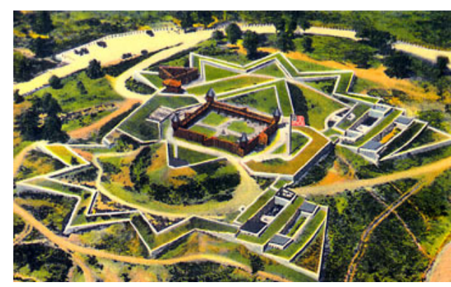
WPA's Reconstruction of Fort Negley Postcard, Circa 1930s

In 1936, 800 men working for the WPA (Works Progress Administration) reconstructed Fort Negley at a cost of $84,000. The Fort reopened to the public in 1938. In the 1960s, Metro Parks removed the deteriorated stockade and closed the Fort to the public.