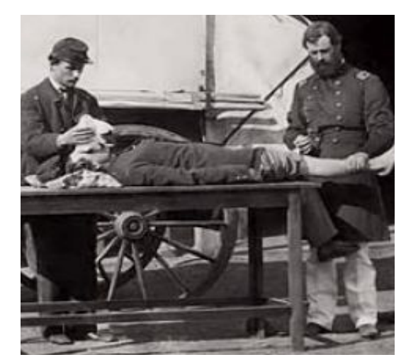
Performing Surgery at a Field Hospital

Union medical records indicate that arms and legs sustained 71% of all gunshots wounds. The dreaded minié ball tore through the flesh, splintered bone and destroyed tissue beyond repair. Fragments of bone along with dirt, torn cloth and germs caused infections. Shattered bones and infections left surgeons with no other recourse but amputation.