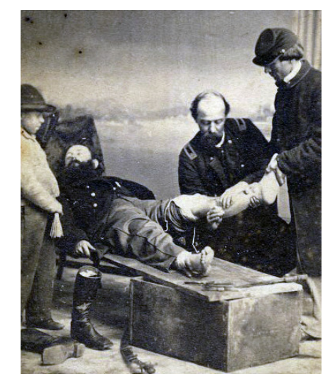
Surgeon Amputating a Wounded Man's Leg Below the Knee

First, the surgeon cleaned out the wound with a cloth. Then, he probed it with his finger removing any foreign matter such as bits of bone, cloth and the bullet. Next, he tied a tourniquet above the injured area to staunch the flow of blood.