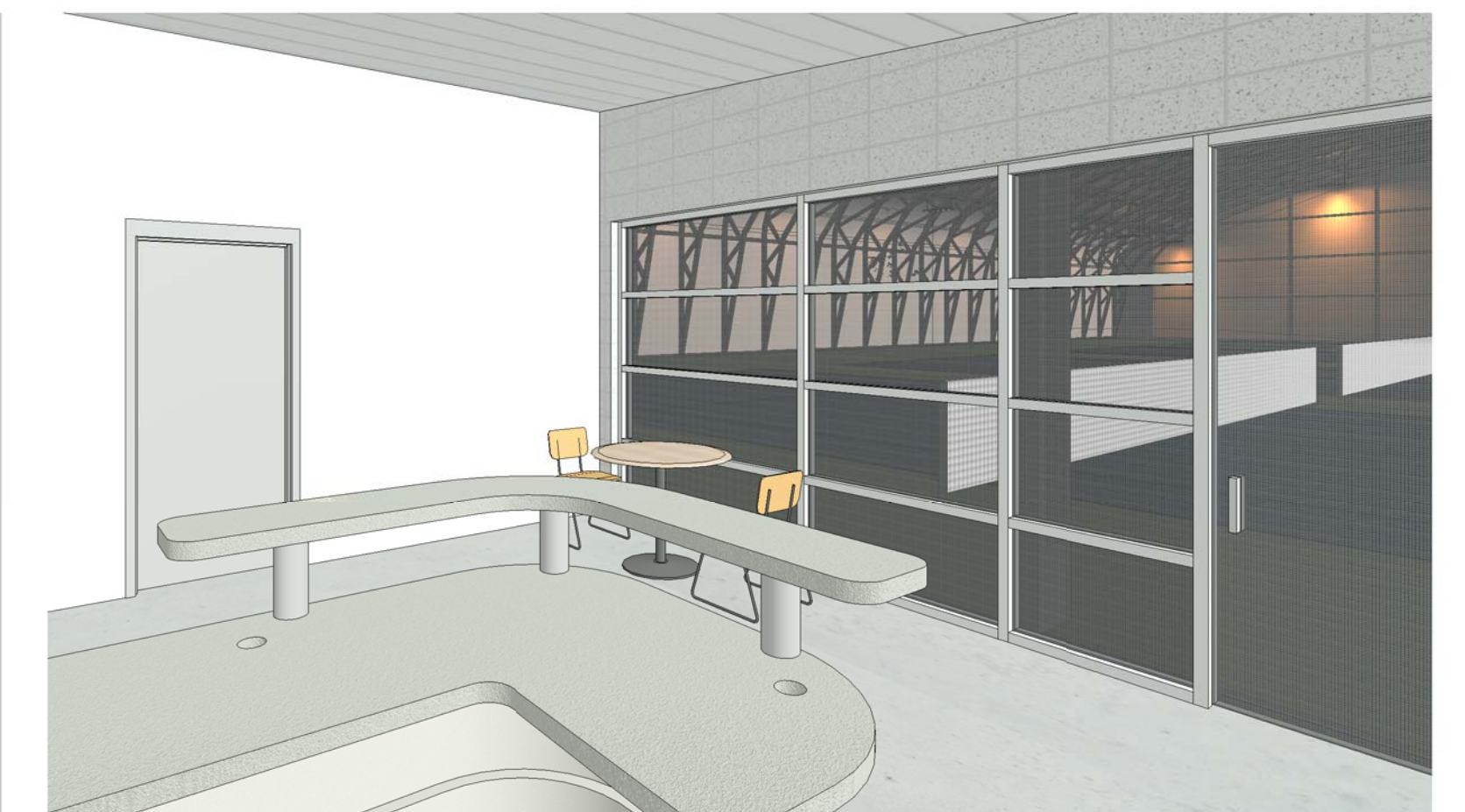
5 LOBBY VIEW