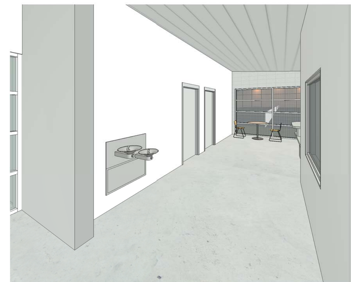
4 RECEPTION VIEW