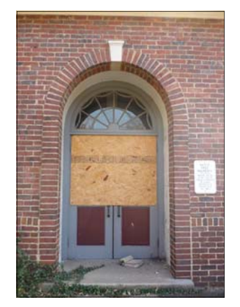
Ransom School is eligible for listing in the National Register of Historic Places.

Our sister organization is the Metropolitan Historical Commission (MHC) which is a municipal historic preservation agency working to document history, save and reuse buildings, and make the public more aware of the necessity and advantages of preservation in Nashville and Davidson County, Tennessee. Created in 1966, the commission consists of fifteen citizens appointed by the mayor.