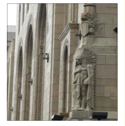
Historic building in Grand Rapids, Michigan reveals the city's history.

If you need a more accurate map, you may obtain one through Community Plans at the Planning Commission for a fee of $25.